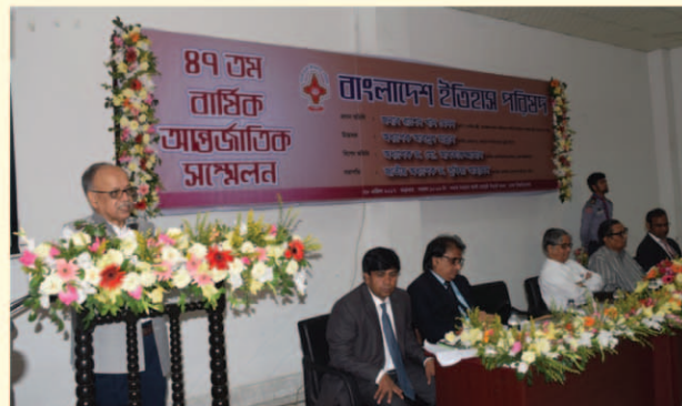
The UGC Chairman speaking as the Chief Guest

Bangladesh Itihas Parishad organized the 47th international annual conference on Bangla Bhashar Sthanio Itihas Charcha (The practice of local history in Bangla language) at Nabab Nawab Ali Chowdhury Senate Bhaban of Dhaka University on 27 April 2017.