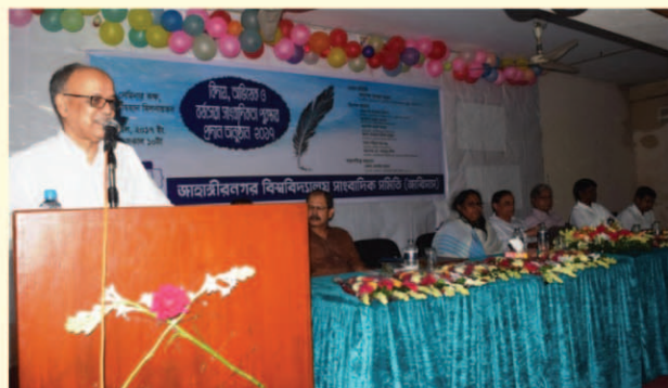
UGC Chairman speaking as the Chief Guest