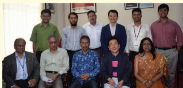
South Korean delegation at UGC