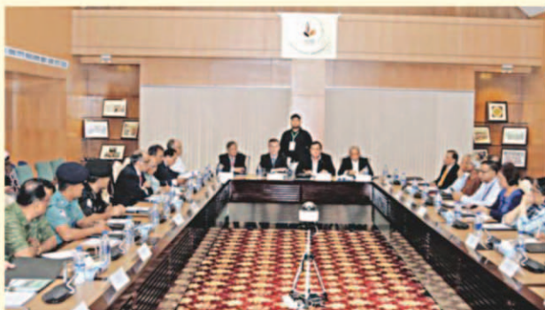
The Round Table

Independent University, Bangladesh (IUB) organized a roundtable on The Prospects and Challenges of International Students in Bangladesh to explore the possibilities for foreign students and scholars in Bangladesh.