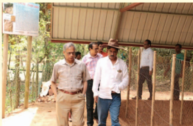
Lotus temple museum at Wari-Bateswar