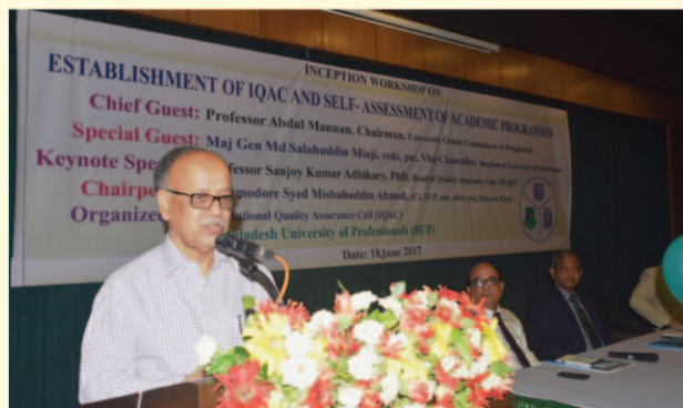
The Chairman of UGC speaking at an inception workshop

Bangladesh University of Professionals (BUP) organized an inception workshop on Establishment