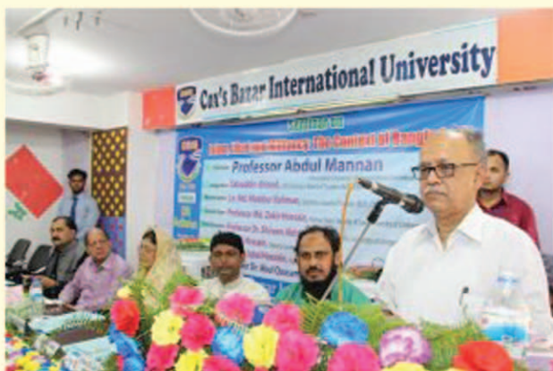
The Chairman of UGC speaking as the Chief Guest

Cox's Bazar International University (CBIU) organized a seminar on Islam, Jihad and Militancy: Perspective Bangladesh at its campus premises on 07 May 2017.