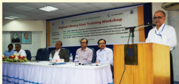
The Chairman speaking at a workshop