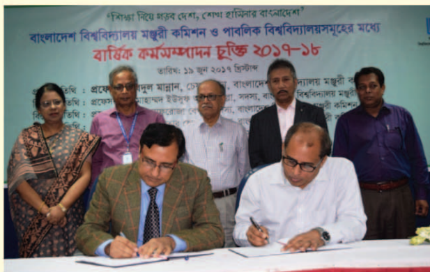
Annual performance agreement signing ceremony