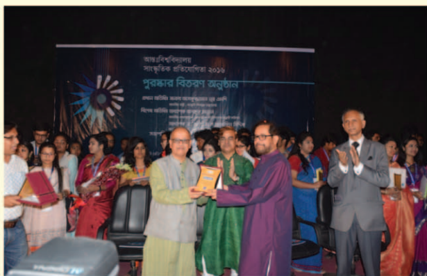
Cultural Affairs Minister handing over a crest to UGC Chairman