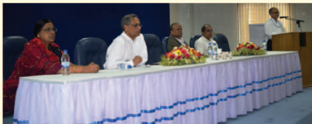
The Chairman addressing the employees of the Commission