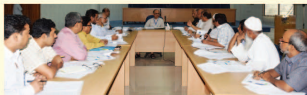
Full Commission meeting