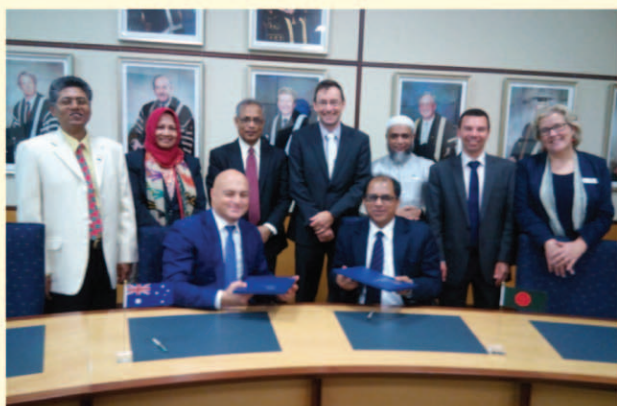
MoU signing ceremony