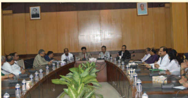
UGC delegation holding meeting with BSMMU authority

Care Medicine, Pediatric Cardiology and Pedodontics. The MD courses under the Department of Pediatrics are Pediatric Neurology and Neuro Development and Palliative Medicine under Medicine Department. BSMMU currently has 7 faculties, 47 divisions and 91 courses.