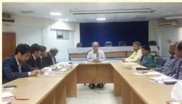
ADB delegation with Chairman and Members of UGC