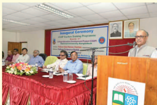
The inaugural Session