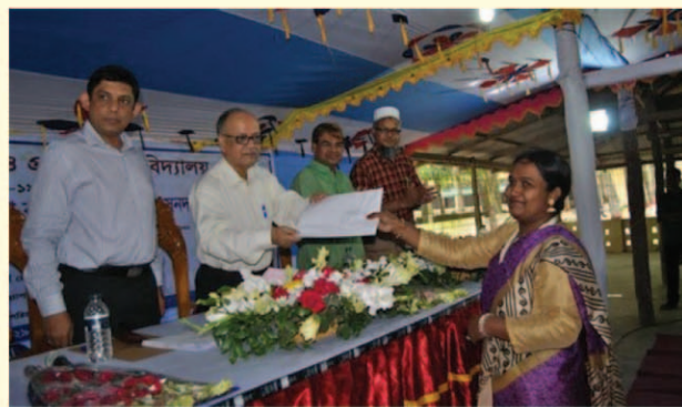
Distribution of certificate

The certificate distribution ceremony for officers and employees of Mawlana Bhashani Science and Technology University (MBSTU) was held at its