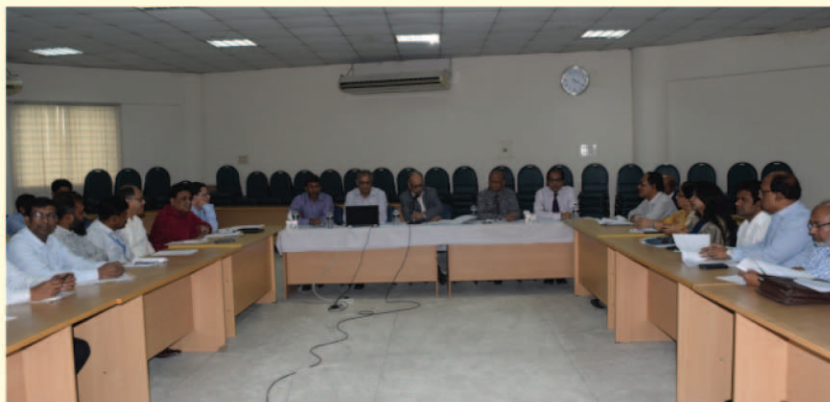
Meeting with the leaders of Teachers' Associations of Public Universities