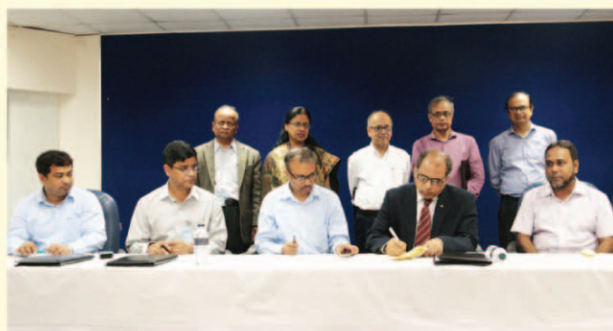
Agreement signing ceremony

Seventeen universities (sixteen public and one private) signed agreement with University Grants Commission (UGC) of Bangladesh to implement 38 Window-1 sub-projects awarded under Round-4 of HEQEP for improvement of teaching and learning quality of the universities. A sum of Tk. 57.62 crore has been allocated against the sub-projects. The agreement signing ceremony was held at UGC auditorium on 30 April 2017.