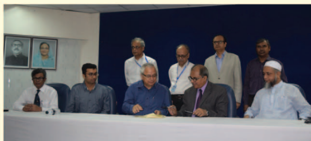
Signing ceremony at UGC

University Grants Commission (UGC) of Bangladesh allocated supplementary fund of Tk. 32.14 Crore to nineteen public universities against 48 sub-projects, earlier completed under Round-1 and 2 (W-1, W-2 and W-3). In this regard, an agreement signing ceremony between UGC and the concerned universities was held at UGC auditorium on 15 May 2017.