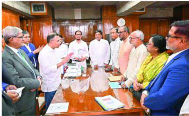
Prime Minister Tarique Rahman presents Eid gifts of Tk5,000 each to sanitation workers of 12 city corporations and hands over the cheques to the mayor of Chattogram City Corporation and the administrators of other city corporations at the Bangladesh National Parliament Secretariat on Sunday.

On the advice of the chief adviser, the president will appoint 10 other advisers to form the caretaker government. All advisers must be non-partisan and neutral. This interim administration will remain in charge until a newly elected parliament is formed and assumes office.