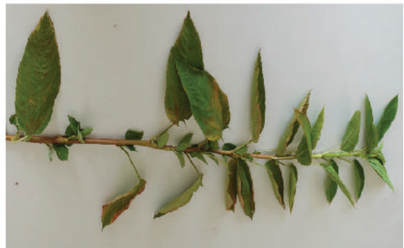
BJRI tosha pat8