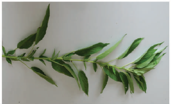
BINA deshi pat2