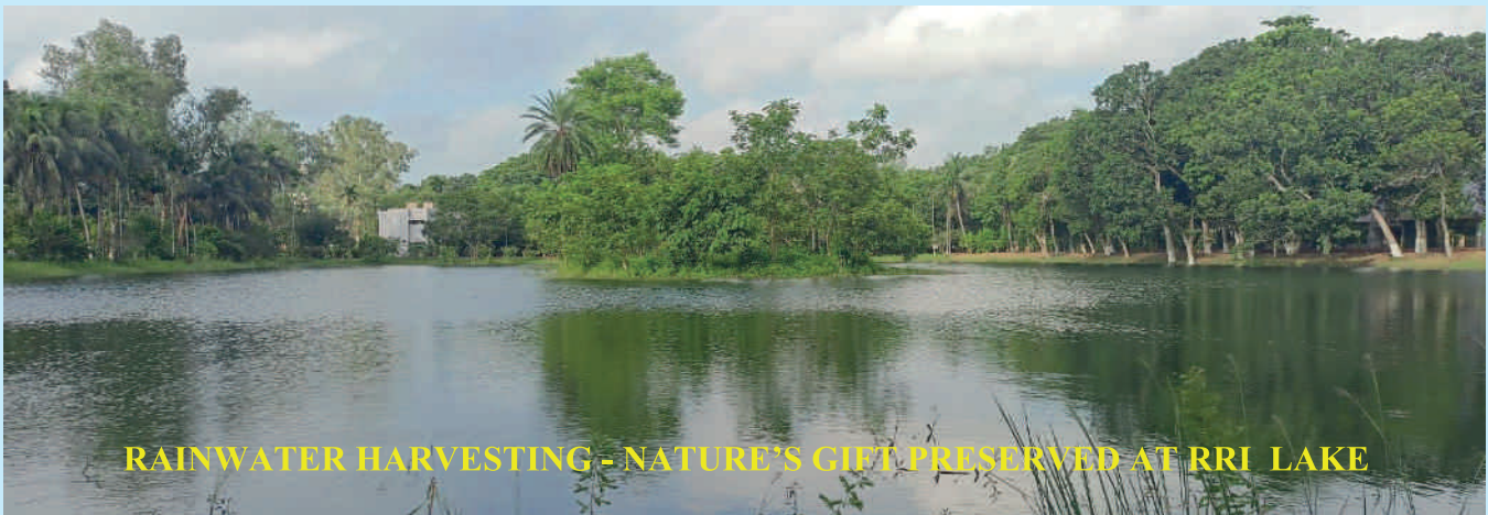
RAINWATER HARVESTING - NATURE'S GIFT PRESERVED AT RRI LAKE