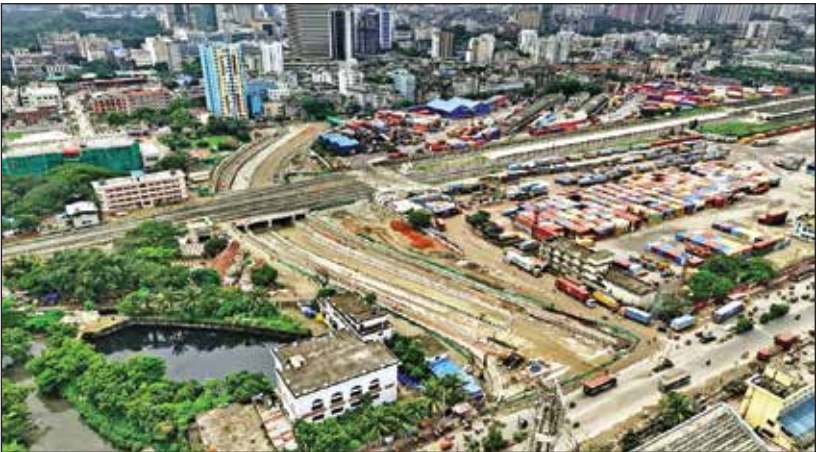
Kamalapur-Titipara underpass in Dhaka.

The railway link over the Jamuna Railway Bridge connecting the East and West zones through the construction of 99 km new dual gauge line and rehabilitation and conversion of 245 km Broad Gauge line from Jamtoil to Parbatipur to Dual Gauge has eased out these operational problems considerably. Improvement will be achieved after completion of Railway link between western side of Jamuna Bridge to Bogra. Further improvement will be achieved after implementation of 8th five year plan which commenced from 2016.