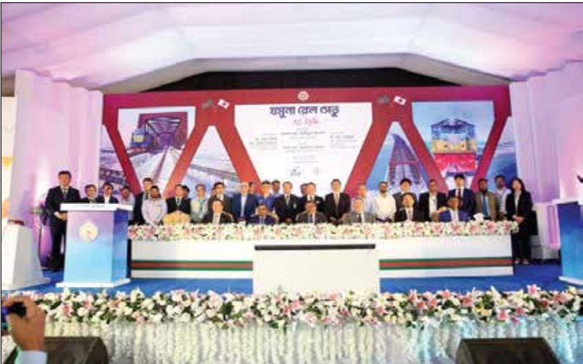
Inauguration Ceremony of Jamuna Rail Bridge.

Bangladesh Railway is not connected with all the Civil Districts of the country. At the end of 2023-2024 only 49 Civil Districts of the country could be connected by Railway. The District-wise Railway stations and Route kilometers are shown in Table No. 4