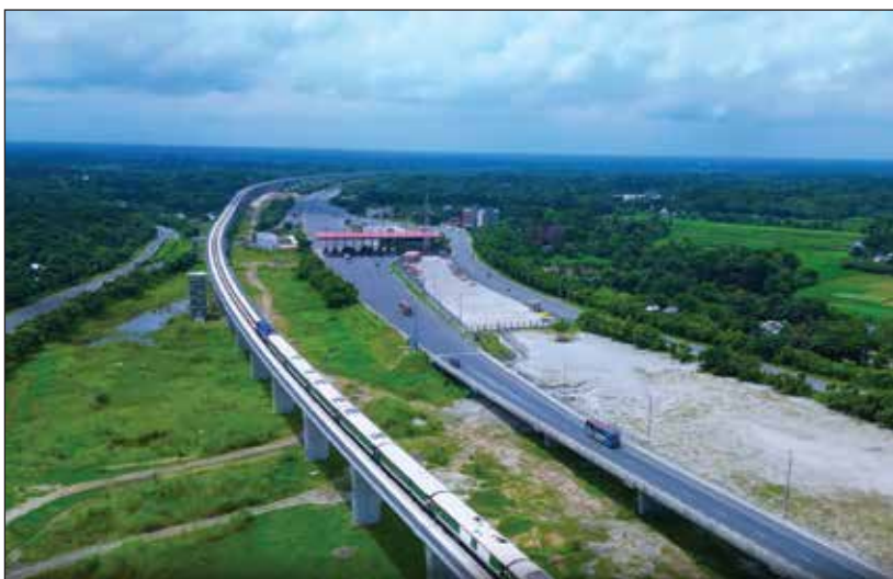
Viaduct-3 (Zanjira) built under the Padma Bridge Rail Link Project