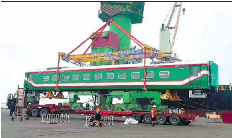
A railway passenger coach, manufactured by CRRC Tangshan Co, is loaded at Tianjin Port for export to Chittagong, Bangladesh.

All of marine vessels are declared surplus as per the CME (west), Rajshahi office. At last, of the marine vessels are hand over to buyer on 12-02-2024. At present, of the marine vessels has no Railway Ferry service.