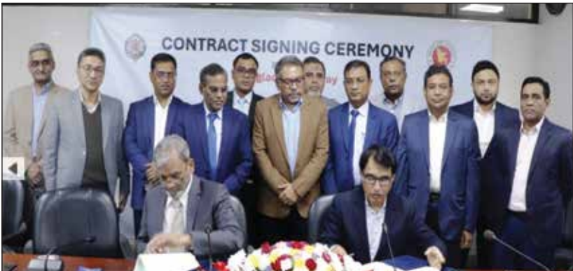
Venture with Development Design Consultants Ltd. (DDC) for Rehabilitation of Sylhet to Chatak Bazar Section (Meter Gauge Track) of Bangladesh Railway, heavily damaged by Flood 2022.

Bangladesh Railway had a total of 542 stations at the end of the year 2023-2024. These include One block hut, Fifteen train halts and Four goods booking points.