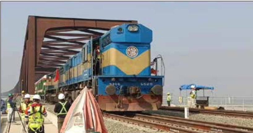
Test run over Jamuna Rail Bridge.

The railway has been facing tough competition with other modes of transport for the high rated traffic, which pay more revenue. On the other hand, the railway is called upon to carry traditional low rated essentials. As a national carrier, BR has obligation to carry essential commodities like food grains, fertilizer, stone & boulders, petroleum products etc. to the remote corners of the country at a cheaper rate. The freight traffic during 2023-2024 was 2084.09 thousand Metric Tonnes against 4414.2 Thousand Metric tonnes during 2022-2023.