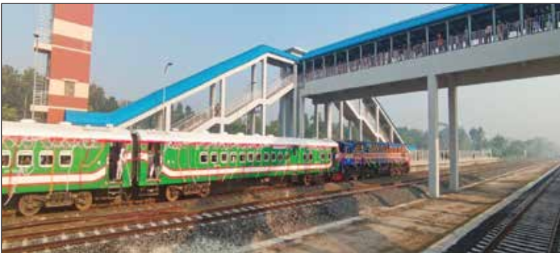
Kashiani Junction Station built under the Padma Bridge Rail Link Project.