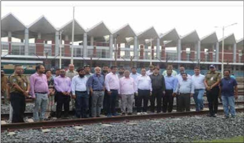
Annual Inspection of Parbatipur-Chilahati Section.

: Additional IG, Bangladesh Police Railway Police Headquarters, Dhaka.