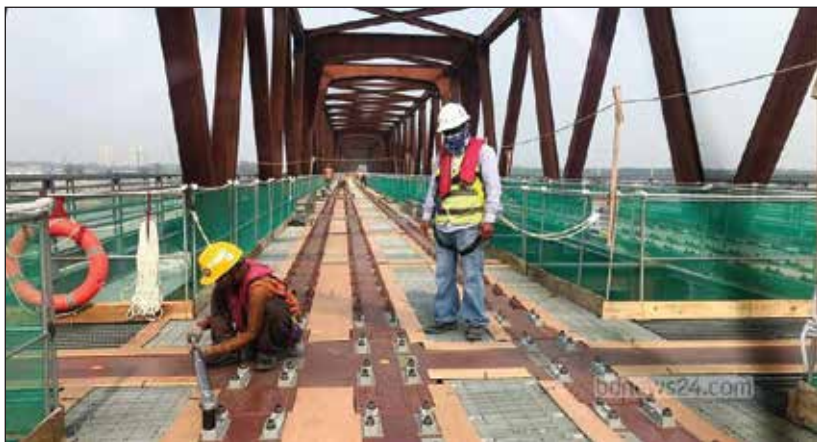
Jamuna Railway Bridge

The total operating expenses for the year 2022-2023 (Considering Social Benefits) amounting to Tk. 33,080.28 million and (Without Considering Social Benefits) amounting to Tk. 23,858.38 million.