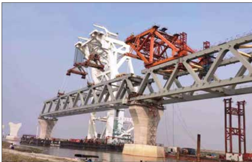
Span installed at Padma Bridge

Bangladesh Railway is not connected with all the Civil Districts of the country. At the end of 2022-2023 only 50 Civil Districts of the country could be connected by Railway. The District-wise Railway stations and Route kilometers are shown in Table No. 4