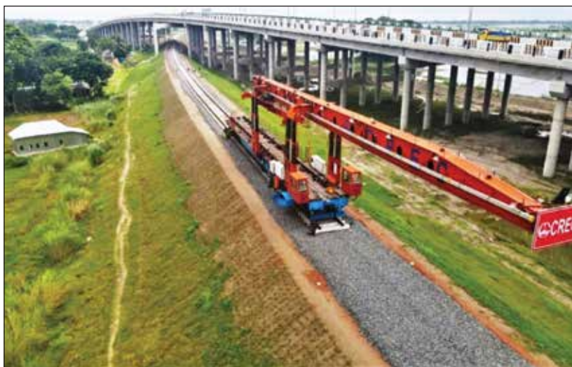
Installation of Railway track under Padma Bridge Rail link project

Bangladesh Railway had a total of 533 stations at the end of the year 2022-2023. These include One block hut, Fifteen train halts and Four goods booking points.