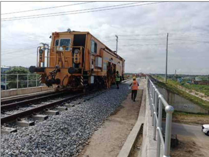
Tamping work at Ramu station under Dohazari-Cox Bazar project