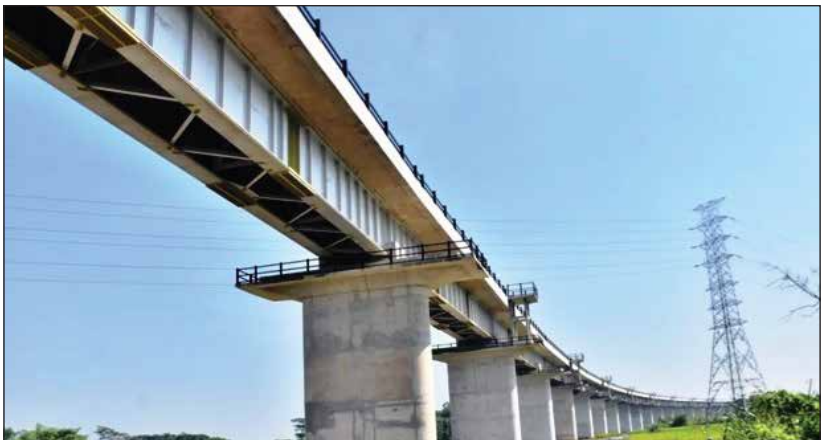
Rupsha Railway Bridge

The railway link over the Jamuna Railway Bridge connecting the East and West zones through the construction of 99 km new dual gauge line and rehabilitation and conversion of 245 km Broad Gauge line from Jamtoli to Parbatipur to Dual Gauge has eased out these operational problems considerably. Improvement will be achieved after completion of Railway link between western side of Jamuna Bridge to Bogra. Further improvement will be achieved after implementation of 8th five year plan which commenced from 2016.