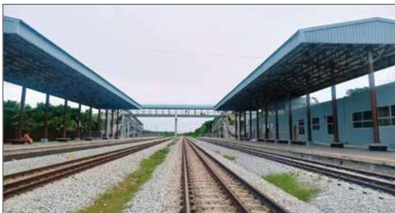
Alishahar Railway station

All of marine vessels are declared surplus as per the CME (west), Rajshahi office. At last, of the marine vessels are hand over to buyer on 12-02-2024. At present, of the marine vessels has no Railway Ferry service.