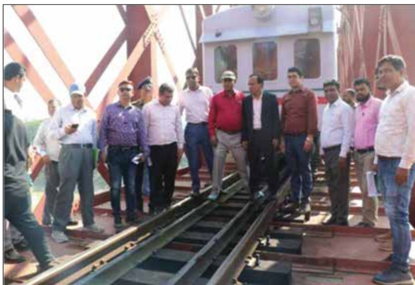
GIBR Inspection at Sylhet-Srimongal section

: Additional IG, Bangladesh Police Railway Police Headquarters, Dhaka.