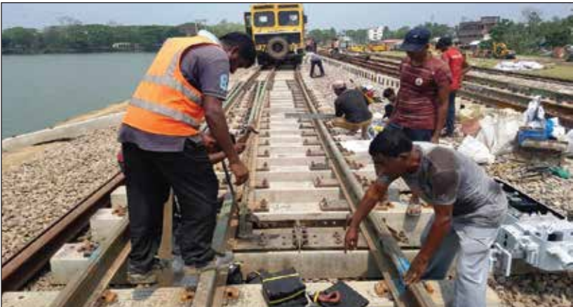
Installation point machine at Gangasagar railway station

The railway has been facing tough competition with other modes of transport for the high rated traffic, which pay more revenue. On the other hand, the railway is called upon to carry traditional low rated essentials. As a national carrier, BR has obligation to carry essential commodities like food grains, fertilizer, stone & boulders, petroleum products etc. to the remote corners of the country at a cheaper rate. The freight traffic during 2022-2023 was 4414.2 thousand Metric Tonnes against 5334.32 Thousand Metric tonnes during 2021-2022.