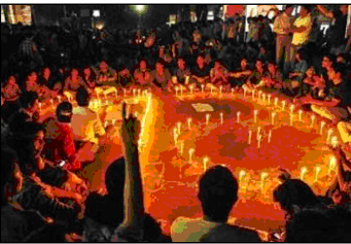
Avʹtʹj v i Dʹrʹmʹtʹe Kʹiʹv Kʹiʹv AʹUʹKʹi v | kʹvʹnʹeʹtʹM MYRʹMi Y gʹtʹAi gʹnʹmʹgʹtʹeʹtʹk tʹgʹgʹeʹmʹZ tʹRʹfʹj RʹbZʹv i Ae`wʹ

÷ v d wʹi tʹcʹvʹUʹŋ \ kʹvʹnʹeʹtʹMi Kʹw` Z cʹRʹbʹtʹPʹZʹi GLb tʹh wʹZʹxʹ ŋʹgʹZʹvʹtʹK` ʹŋ tʹmLʹv tʹ_K KʹgʹmʹPʹi bʹtʹq ʹuʹKʹy AvʹmʹtʹQ Avʹi Zʹv cʹyʹj b Kʹiʹv nʹtʹQ mʹi Kʹwʹi cʹāʹtʹcʹvʹl KʹZʹvʹq | KʹtʹqʹKʹRʹb eʹMʹtʹi i bʹtʹq cʹwʹl Pʹwʹj Z kʹineʹM Avʹtʹ vʹj tʹbi tʹNʹvʹI Y v I `wʹe tʹj v mʹi Kʹvʹtʹi i wʹeʹfʹbʹaʹcʹhʹeʹj tʹ_K tʹhʹfʹiʹtʹe ev `bʹvʹqʹb Kʹiʹv nʹtʹQ ZʹtʹZ AʹtʹbʹtʹK i gʹtʹb B cʹkʹe RʹwʹMʹtʹQ tʹh, cʹāʹvʹgʹsʹyʹi Kʹvʹhʹŋ tʹq i ci kʹvʹnʹeʹtʹMi tʹgʹvʹo wʹK wʹeKʹi ŋʹgʹZʹvʹtʹK` `nʹtʹq Dʹvʹj ? kʹvʹnʹeʹM tʹ_K tʹNʹvʹI Y v i cʹi cʹkʹvʹmʹtʹbi cʹāʹvʹtʹK` `a mʹi Pʹeʹj q tʹ_K tʹeʹwʹi tʹq gʹsʹtʹ-mʹi Pʹeʹi v wʹzʹb wʹgʹuʹb i v `l q `wʹtʹq Zʹv Zʹwʹj