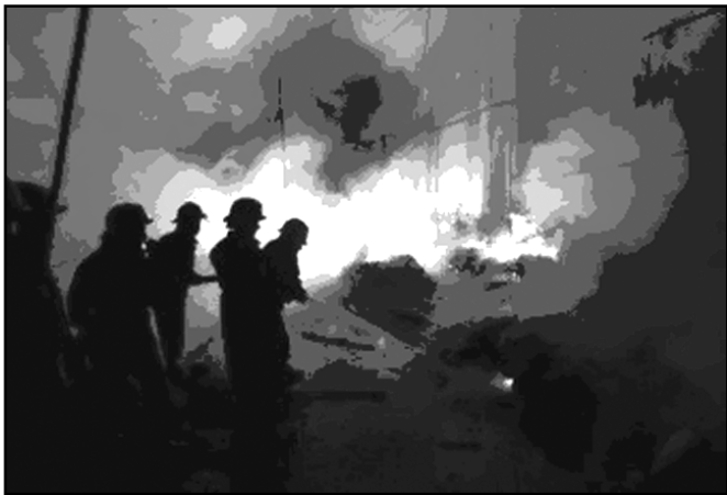
Awfhtb tndvRZg`v` kvcjv` Pzj`

SiUKv Awfhtb Ask` tbqv AvBb-k:Ljv i`q`vKvix ewnbri `Rb` m`m` `ubK BbKj`v`et`j` b, SiUKv Awfhtbi Av`tMB w`c`j` mSL`K` U`K` Avbr` nq| ZvQov` Awfhtbi ci` `z` G`j`vKv cwi`vi Kivi Rb` w`mU` Kt`c`f`i`k`ti` t`j`vKRb`K` At`c`q`vY ivLv` nq| Awfhtbi ciciB` Zivv gwZvSj` G`j`vKv cwi`v`i`i Rb` g`v`V` b`v`gb| cO`w`K`f`v`te Awfhtbi w`w`f`b`e` ai`t`bi Avj`v`G` Ges` nZv`v`Z`i` i`3`I` cwi`vi Kiv` nq| tndvRZKgfiv` Pj` hv`l`q`vi` ci` gwZvSj`i` mo`K` AmsL` KivMR, m`v`Uj` Ges` w`K`O`v`e`im` cto`vKtZ` t`Lv hvq| w`w`f`b`e` `v`b` `e` Kt`i` ivLv` Kiv`R` Av` b`l` Rj`w`Qj`| c`v`o`t`q` t`q`v` c`v`v`U Mw`o`l` t`Lv hvq` mo`K`i` cv`k`| AvBb-k:Ljv ewnbri` m`m`i` t`vKv`Z` mo`K` w`f`v`R`K`i` w`-t`j`i` teov` t`f`i`o` mo`K`i` Ici Avov`Aw`o` Kt`i` t`i`L`w`Qj` tndvRZKgfiv| t`mL`v`b` t`_t`K` BU` L`j`j` I Zivv` UK`v`iv` UK`v`iv` Kt`i` iv`L, hv` c`v`k`i` w`tK` t`O`v`n` nq|