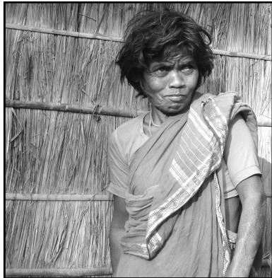
074-Gi Avtɨj ʔ PɨZ Kɨmɨmɨgɨi ʔ Pɨj gɨvɨi e mɨsɨi

Gɨtɨk nj y misew KZvi mPɨvɨl nq mK GB mgtɨq | Aaɨɨ vɨj ʔ ZLbKvɨ ʔ MYKEʔ cɨmɨ Kɨtɨk ɨNɨtɨi iia nq GB cɨYzɨv | GB cɨmɨ Kɨv GK j misew ʔ ki tɨmɨ ʔ bi ʔ bi vɨi Y misew KZv t ʔ kɨi Zi aɨ cɨRɨtɨbɨi gɨa ʔ hɨ o PɨAj ʔ I DɨERbɨv Qmɨtɨq ʔ ʔ tɨmɨ | mK GB mgtɨq B ʔ vɨgɨab ʔ Kɨe i mɨK AvRv mɨLɨt ʔ mɨ t ʔ Lɨmɨtɨj b ʔ fɨvZ t ʔ nɨvɨgRv v, bBɨtɨj gɨbɨPɨt Lɨvɨtɨ ʔ Kɨe Zv | mK sɨth msev ʔ I Qmɨi gva ʔ g misew KZv t ʔ qɨɨtɨi Gɨtɨki gɨbɨy fK ʔ c b t ʔ i tctɨmɨ ʔ j Zv nɨ ʔ Q Pɨvɨɨtɨi i ʔ fɨɨɨ cUfɨvɨtɨ Z ʔ mɨK ʔ BɨEdvK ʔ G Qvcɨtɨv Kɨmɨmɨgɨi ʔ Pɨj gɨvɨi e mɨsɨi Rɨj cɨv QmɨU | QmɨU t ʔ k I AvsRɨZK fɨvɨ e vck Avtɨvob Zɨj ʔ qj tɨm mgq | GB QmɨB nɨ ʔ Q Gɨtɨk nj y misew KZv cɨg mɨvɨ |