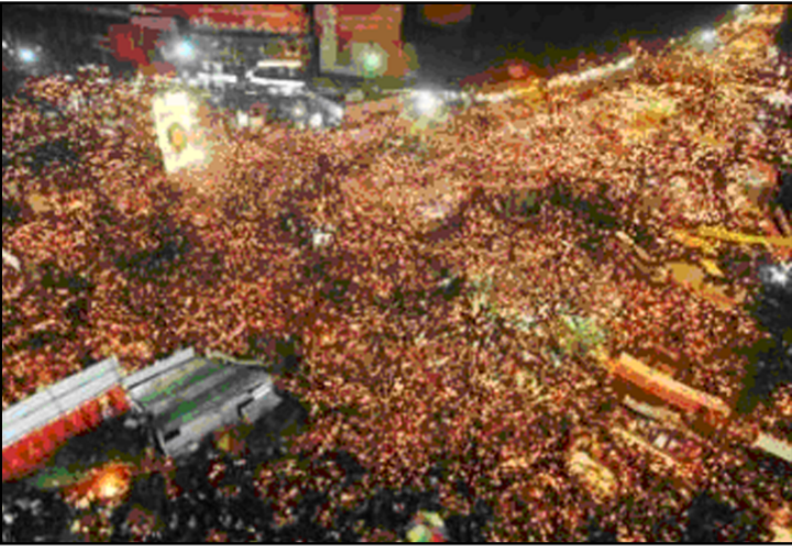
k`i`n`e`t`M` P`Z`i` M`Y`R`v`M`i`Y` g`t`A`i` g`n`m`g`v`t`e`k` R`b`Z`v`i` X`j`

d`u`m`i` `m`e`t`Z` e`M`v`i`t`i` e`v`i`b`i`t`i` P`r`i` w`b` a`t`i` P`j`v` K`g`f`i`P` M`Z`K`v`j` A`v`l` q`v`g`x`j` i`M` I` e`v`g` i`v`R`%`b`w`i`Z`K` `j` , Z`v`i` `i` m`S` `u`Z`K` c`h`u` G`e`S` G`K`B` N`i`i`v`r`i` m`P`i`y`Z` e`v`x`R`e`x` I` t`b`Z`v`i` `i` `L`t`j` i`u`Q`j` | g`v`g`y` `U`R`q` e`i`S`j`v`-R`q` e`l`e`U`l`y`t` m`t`b`i` g`t`a` e`v`i`v` A`v`l` q`v`g`x`- e`v`K`k`v`i`x` K`v`q`v`q` i`f`b`g`Z` `j`b`-`g`t`b`i` u`l`v`i` w`t`q`t`Q`b`| Z`v`i`v` m`i`K`v`i`i` A`c`K`t`g`f` m`g`v`t`j`v`P`b`v`K`v`i`x` M`Y`g`v`a`t`g`i` m`e`i`f`x` m`e`t`l`v`M`v`i` K`t`i` Z`v` e`R`f`i` b`W`K` w`t`q`t`Q`b` ; m`i`K`v`i` m`g`_`R` e`v`x`R`e`x`i`v` i`Y`u`l`v`i` w`t`q` c`i`Z`c`f`l` i`b`g`f`i` k`c`_`i`b`t`q`t`Q`b`| m`e`t`i`v`a`x` g`Z`v`t`k`P` g`m`j` K`v`b`v`a`x` m`e`i`f`b`e` c`i`Z`o`v`t`b` j`m`v` i`b`t`q` A`v`l`u`g`Y` I` `L`j` K`i`v`i`l` t`N`v`l`Y`v` w`t`q`t`Q`b` Z`v`i`v`l` K`w`_`Z` O`t`P`Z`b`v` `q`v`i`u`-G`i` g`t`L`i`k` L`t`j` t`d`t`j` c`i`l`u`q`v`e`t`e` M`p`h`y`x`i` D`m`K`u`b` w`t`q`t`Q`b` m`k`x`j` m`g`v`t`R`i` c`i`Z`i`b`w`a` `m`e` `v`i` A`v`l` q`v`g`x` e`v`x`R`e`x`i`v`|