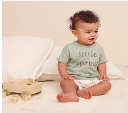
Hot weather dress for baby

Lightweight and breathable fabrics: Choose clothing made of lightweight and breathable materials such as cotton or linen to help keep children cool and allow air circulation.