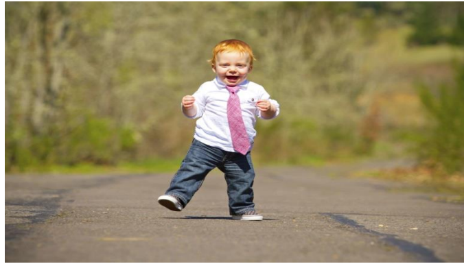
Running and walking