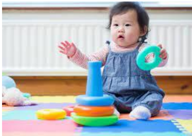
Observing child's development

When children require specialist assistance, it is important to identify their needs and seek advice from professionals who specialize in addressing those specific needs. This ensures that children receive the appropriate support and interventions to overcome any challenges they may be facing.