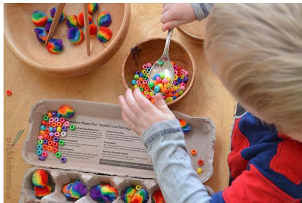
Manipulating small objects

Fine motor skills allow children to manipulate small objects like beads, buttons, Lego blocks, and puzzle pieces. They develop the ability to pick up, stack, sort, and manipulate these objects using their fingers with increasing control.