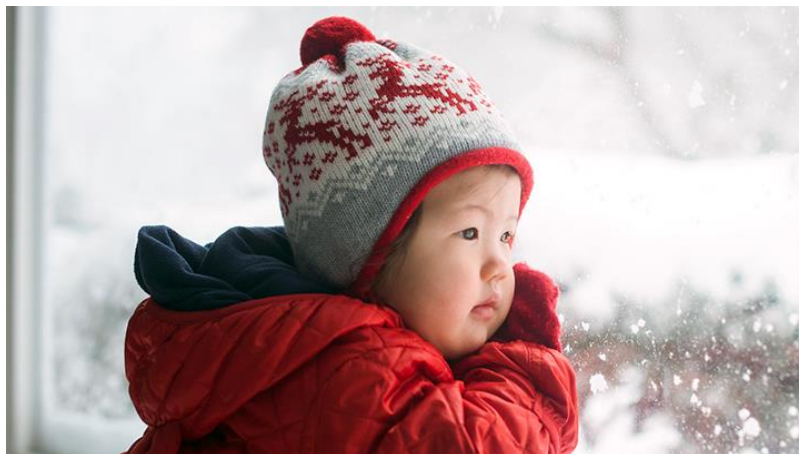
Cold weather dress for baby