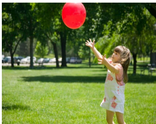
Throwing and catching

Gross motor skills include the ability to throw and catch objects with accuracy and coordination. Children learn to coordinate their arm movements, adjust their force, and track moving objects with their eyes.