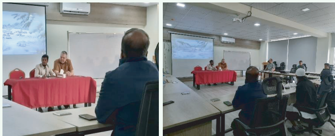
Training Session is going on