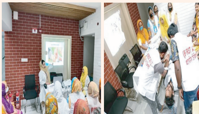
Theoretical & Practical Sessions in Training

A half-day "Training on First Aid" was held at Azim and Son (Pvt.) Ltd., 36A Indira Road, Dhaka, on February 13, 2025. The event was organized by NOSHTRI with support from DIFE, Dhaka, and attended by 40 (forty) employees and workers of the said factory.