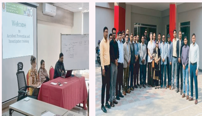
Training Session & Participants' Group Photo

A five-day training program, "Accident Prevention" (February 16–20, 2025), was successfully conducted at NOSHTRI. Organized jointly by DIFE and the Danish Working Environment Authority (DWEA), the program contained eight OSH team members from the Accident Prevention unit and 20 (twenty) DIFE officials from various districts. On February 18–19, OSH team members led a DIFE-to-DIFE training session on accident prevention for the 20 (twenty) DIFE officers. A Danish expert, serving as the trainer, monitored all sessions throughout the program. The training advanced participants' knowledge of workplace accident prevention and investigation. At the end of the DIFE-to-DIFE session, participants evaluated the program and provided feedback.