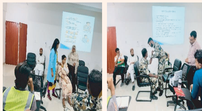
Practical Session during Training

A half-day first aid training was staged on February 26, 2025, at Bangladesh-India Friendship Power Co. (Pvt) Ltd. in Sagamari, Katakali, Rajnagar, Rampal, Bagerhat. Organized by NOSHTRI with support from DIFE, Khulna, the session was attended by employees and workers of the company.