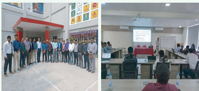
Participants' Group Photo and Training Session