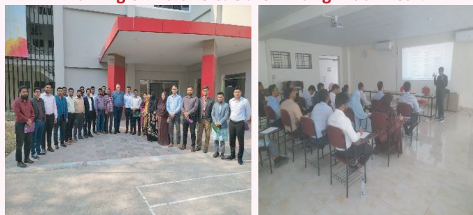
Participants' Group Photo and Training Session

A five-day training program on "Crane & Other Lifting Machines" jointly organized by DIFE and the Danish Working Environment Authority (DWEA) was successfully completed at NOSHTRI from February 16–20, 2025. The program included 28 (twenty-eight) participants—eight members of the OSH Team for Crane Safety and 20 (twenty) DIFE officers.