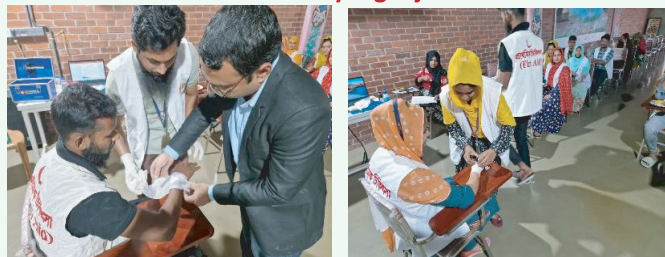
Practical Session during the First Aid Training

In addition to on-campus training, NOSHTRI has introduced on-site training programs. As part of its ongoing initiatives, NOSHTRI has launched first aid training for first aid team members as well as other employees in various labor-intensive factories across the country. This initiative will enhance workers' first aid skills and improves their ability to respond effectively during emergencies.