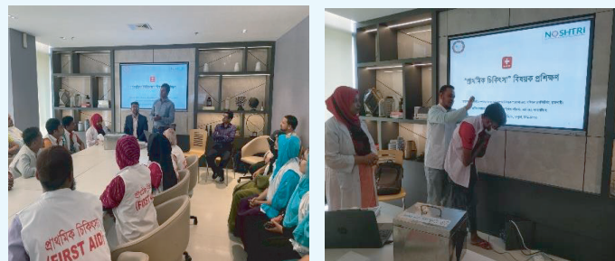
Theoretical & Practical Session during Training

A half-day "Training on First Aid" took place on February 27, 2025, at SQ Celsius Limited, Jamirdia, Habirbari, Bhaluka, Mymensingh. The event was arranged by NOSHTRI with assist from DIFE, Mymensingh, and attended by 40 employees and workers of the factory.