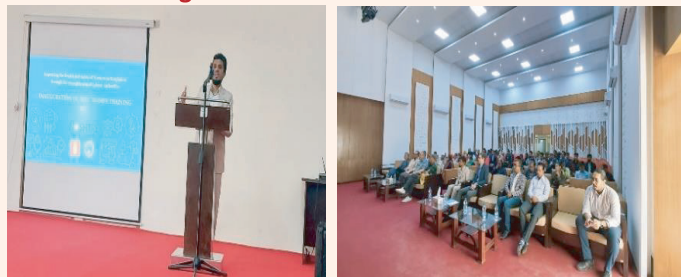
JIG NOSHTRI, Participants and Invited Guests