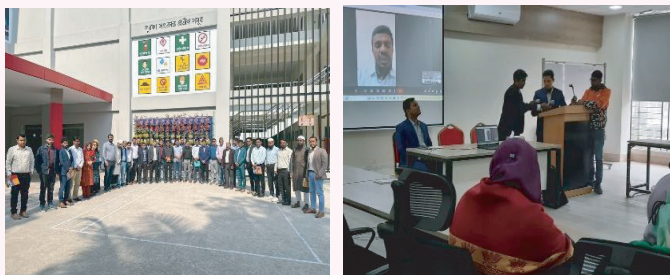
Participants’ Group Photo and Training Session