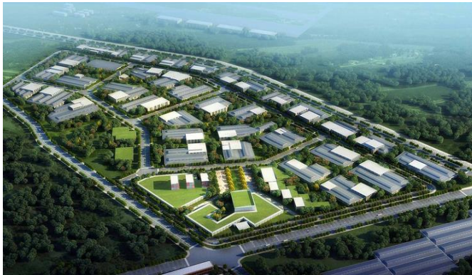
Mirsarai Economic Zone

✧ The Bangladesh Economic Zones Authority (BEZA) is actively pursuing the establishment of 100 economic zones, with 28 currently in various stages of implementation. Among these, a 1,000-acre Japanese economic zone is being developed in Araihasar, Narayanganj.