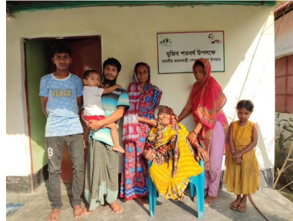
'Ashrayan' (Housing for homeless people)