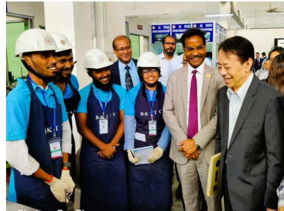
Skills Development Program by SEIP