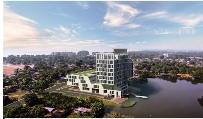
Bangabandhu-Sheikh-Mujib High Tech Park, Rajshahi