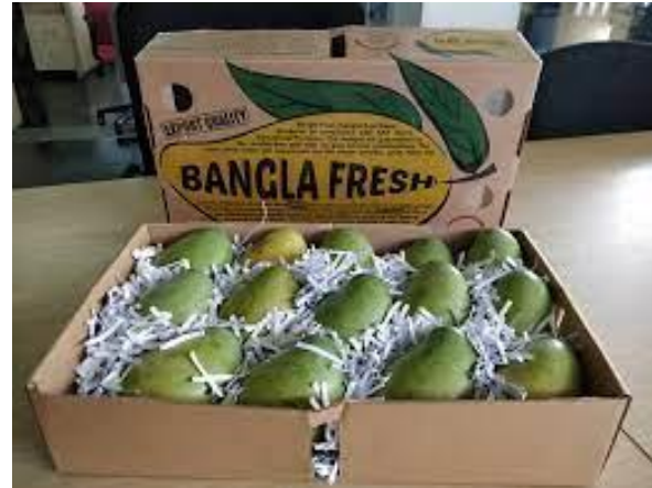
Mango Production and Exports has been Increasing