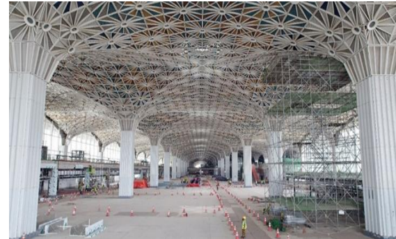
Third terminal of Hazrat Shahjalal International Airport