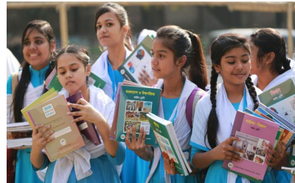
Annual Book Distribution Festival