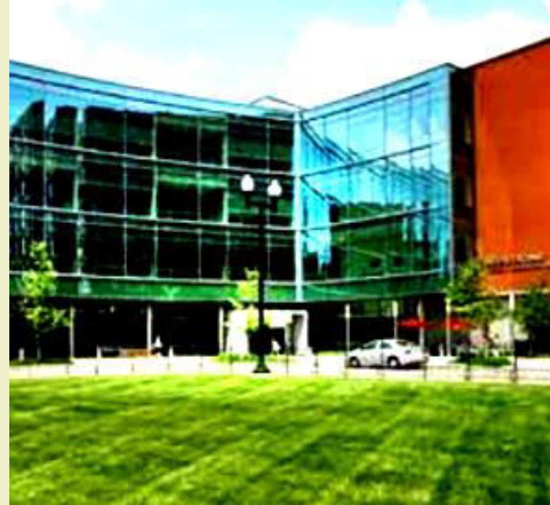
Armstrong Medical Education Building of Johns Hopkins School of Medicine

Medical Education Department (MED) in every Medical & Dental College of Bangladesh