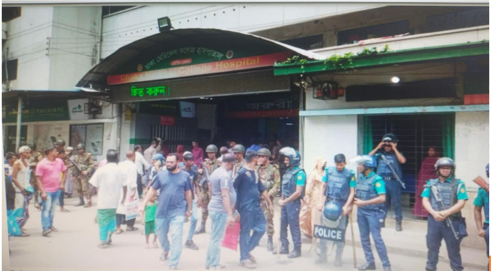
Police are seen outside Dhaka Medical College Hospital (DMCH) on Sunday, September 1, 2024.