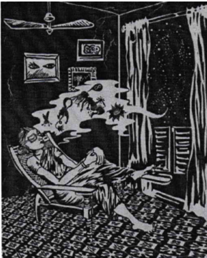
'Sultana's Dream' by Rokeya S. Hossain.

During the 10th MOWCAP General Meeting, a historical achievement was made in the history of the MOWCAP Regional Register. All 20 nominations submitted for the 2024 cycle were inscribed, resulting in a 100% success rate.