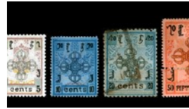
20 NEW INSCRIPTIONS TO THE MOWCAP REGIONAL REGISTER