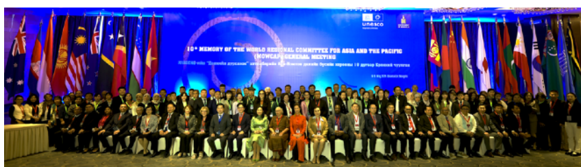
Group photograph taken on 7 May 2024, the first day of the 10th MOWCAP General Meeting.