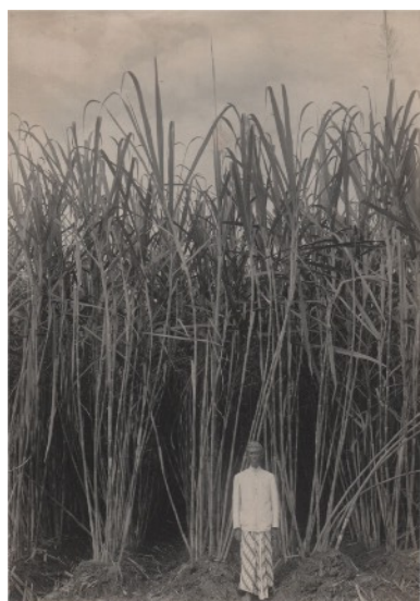
Indonesian Sugar Research Institute’s Archives 1887-1986.

Archives 1887-1986: The Role of ISRI’s Research Activities to the World Sugar Industry;