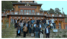
10TH MOWCAP GENERAL MEETING HELD IN MONGOLIA