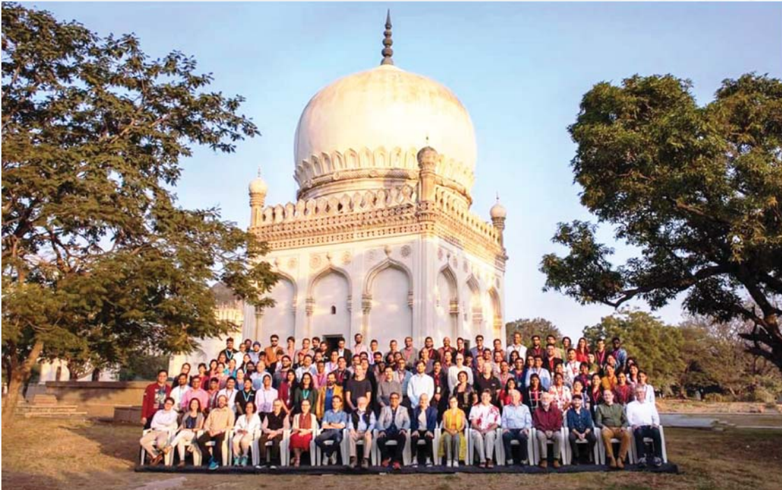
Bangladesh delegation along with the participants of other countries in a photo session at a workshop on Film Preservation & Restoration held in Hyderabad, India, 2019