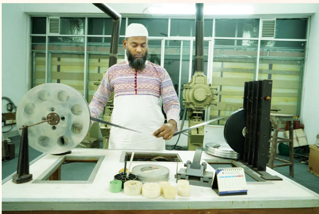
Film checking activities at the film hospital of Bangladesh Film Archive

Bangladesh Film Archive stands committed to the spirit of the Student–Mass Uprising of 2024, working tirelessly to build a Developed Bangladesh in step with the ever-changing tides of technology. With technical capabilities comparable to those of developed nations, the Archive has already earned recognition as the country's premier institution for film preservation. Inspired by the vision of progress and people's aspirations, Bangladesh Film Archive remains ever-prepared to face new challenges and continues moving forward toward its ultimate mission: safeguarding the art, culture, and heritage of Bangladesh for generations to come.