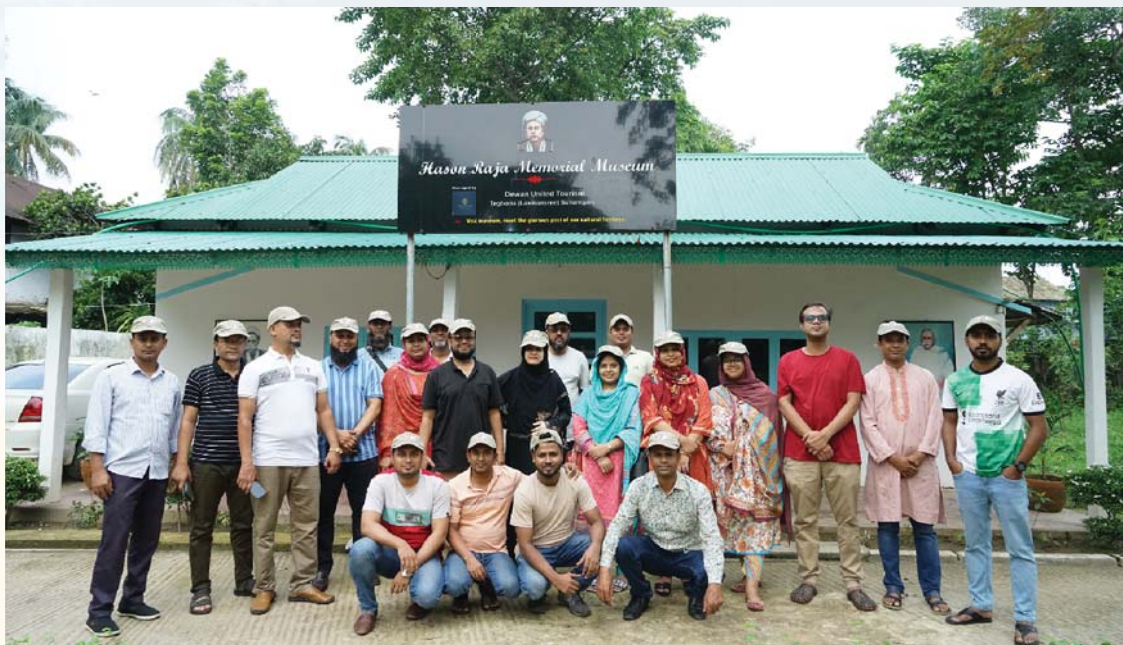
Visit to Hasan Raja Museum under Innovative Training, Sunamganj, June 2024