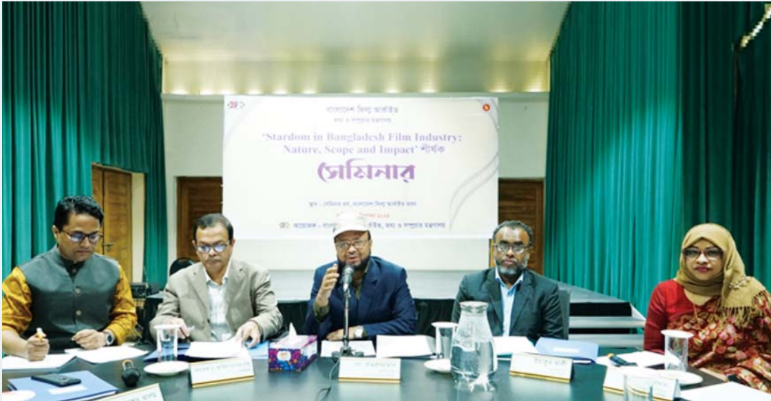
Seminar on 'Sardom in Bangladesh Film Industry: nature scope and impact' held at Bangladesh Film Archive, 8 December 2024