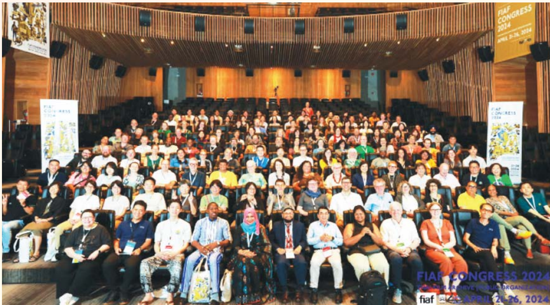
Delegation of Bangladesh Film Archive with participants at the International Federation of Film Archives (FIAF)-Congress held in Salaya, Thailand, 21-26 April 2024.