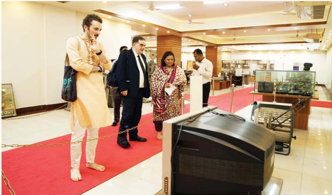
Member of French delegation visited Bangladesh Film Archive Museum, 29 September 2025