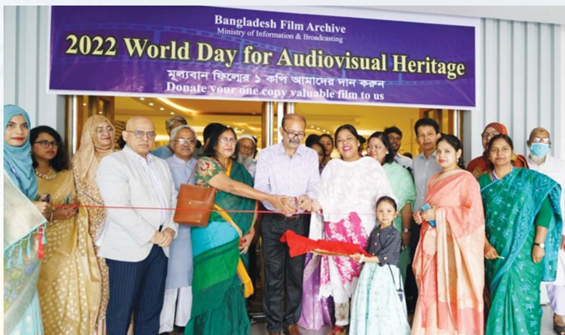
International world Day for Audiovisual Heritage, October 2022