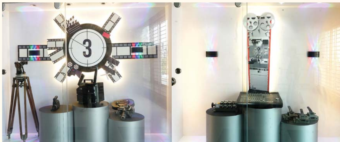
Mini Museum on different floors