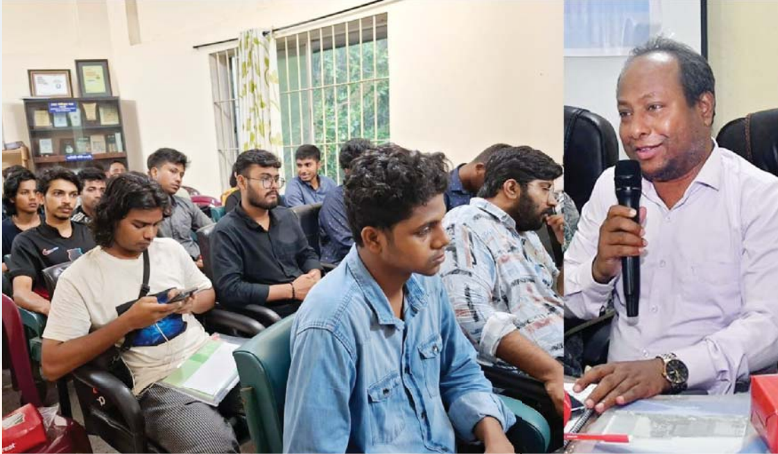
Film screening and views exchange meeting with Chattogram University under the July Rejuvenation Programme 2025, Chattogram, 3 May 2025