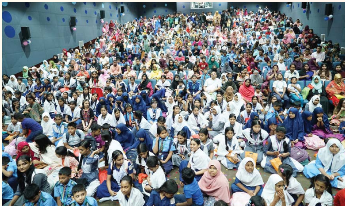
Children at drawing competition and discussion programme on the occasion of anniversary of the July Uprising 2024, 3 August 2025