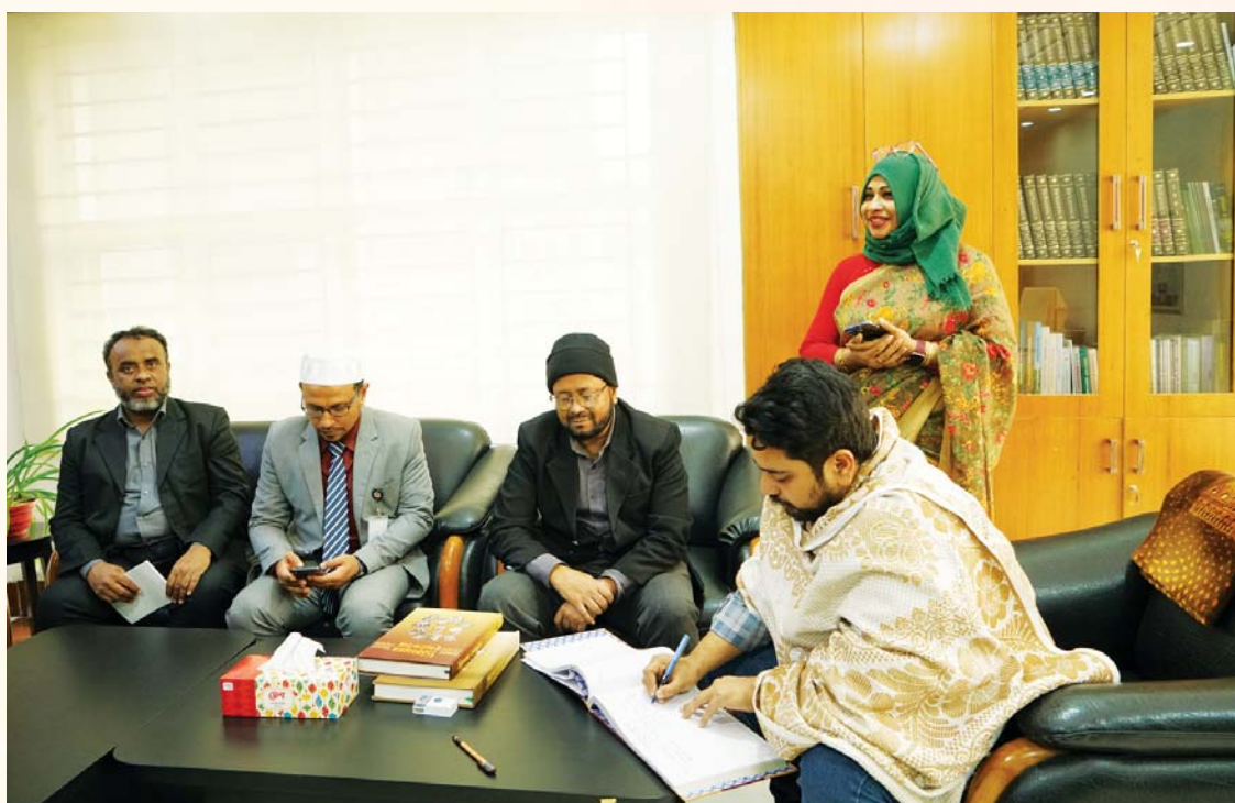
Nahid Islam, former Adviser of Ministry of Information and Broadcasting signs the visitor's book after visiting Bangladesh Film Archive on 7 January 2025