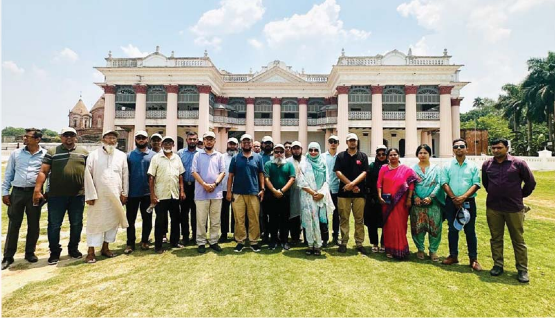
Officials of Bangladesh Film Archive visit Puthia Rajbari Museum in Rajshahi, May 2024