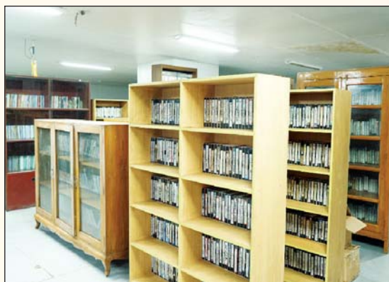
Black & white and color film negatives and prints stored in various vaults at specified freezing temperature