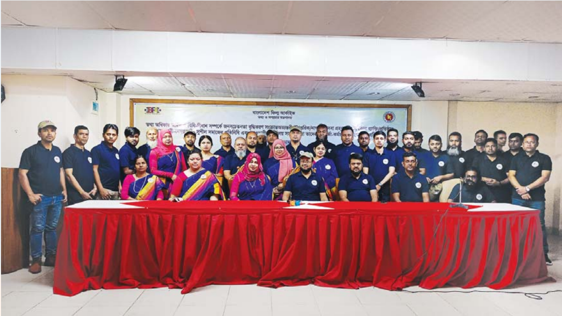
Officials of Bangladesh Film Archive in Rangamati under Refreshing programme, 29-30 November 2024