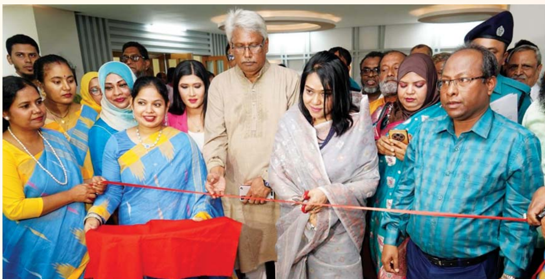
Inauguration of the 47th Anniversary of Bangladesh Film Archive, 17 May 2025