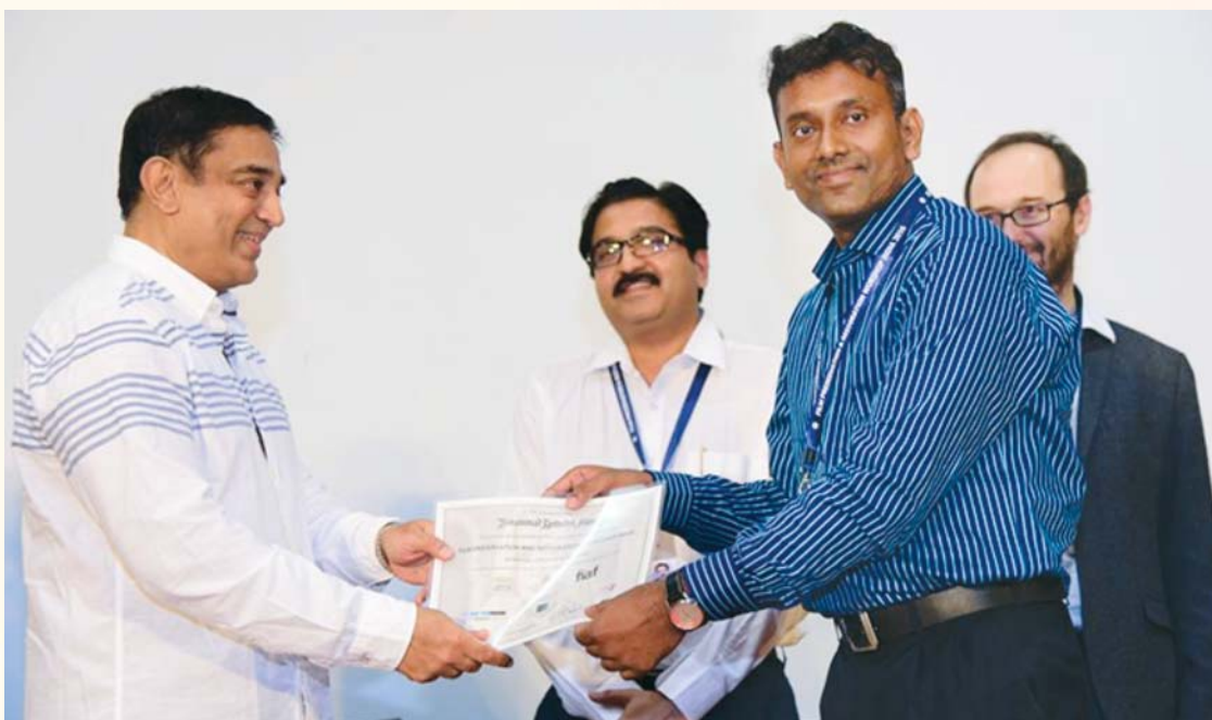
Bangladesh Film Archive delegation receiving certificates at the 'Film Preservation & Restoration Workshop' held at Pune, Hyderabad in India, 2016