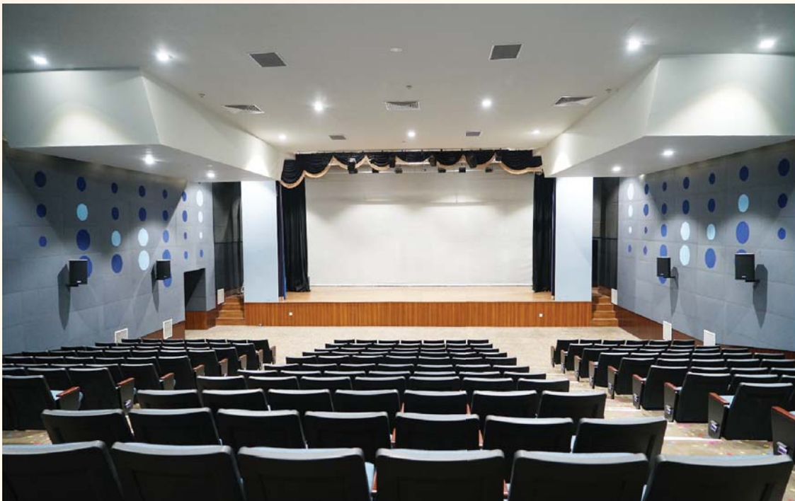
300-seater Projection Hall