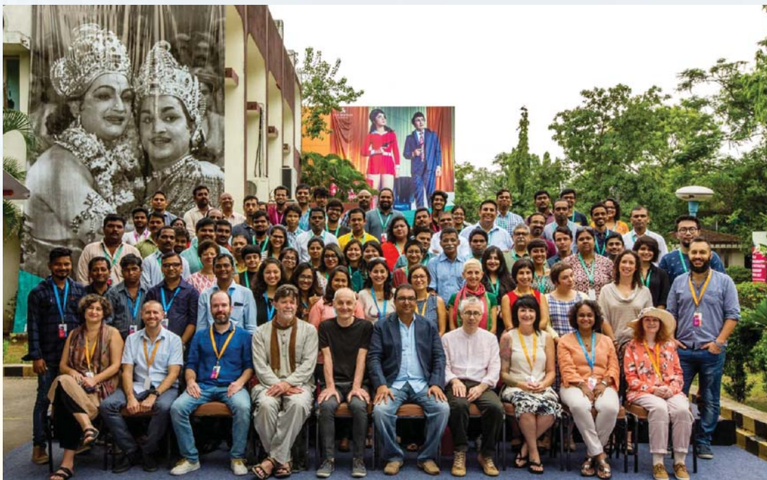
Bangladesh Film Archive delegation in Film Preservation and Conservation Workshop, India, 2017