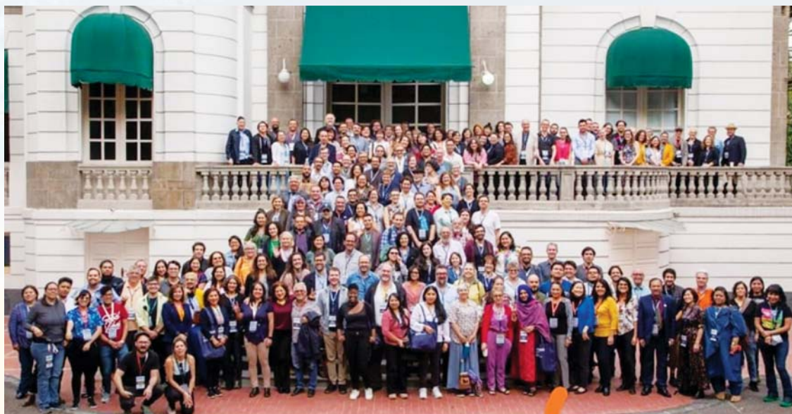
Delegation of Bangladesh Film Archives with participants at the International Federation of Film Archives (FIAF)-Congress held on 16-21 April 2023 in Mexico City ,21 April 2023