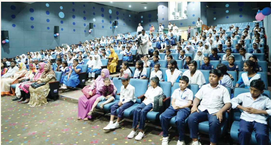
School & college students at BFA auditorium at the event of screening films & documentaries on the July Uprising as a part of a week-long programme (15-21 July 2025) organized by Bangladesh Film Archive under the July Resurgence Programme 2025, 20 July 2025