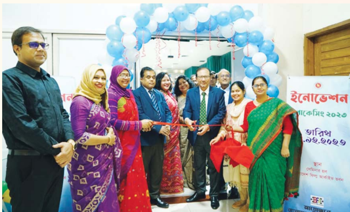
Inauguration of 'Innovation Showcasing, December 2023