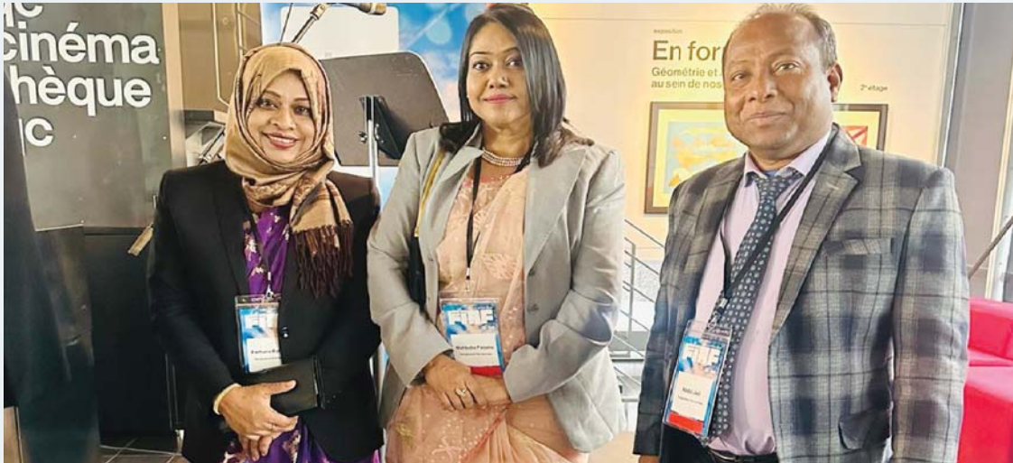
Bangladesh Film Archive delegation at FIAF Congress, Montreal, Canada, 27 April-2 May 2025