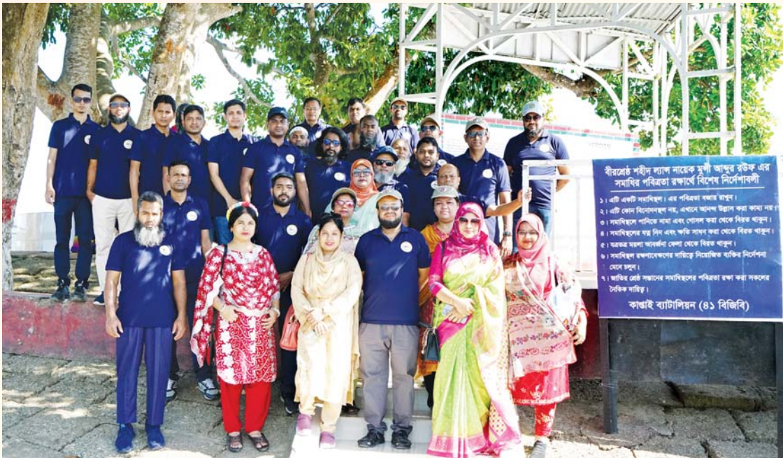
Bangladesh Film Archive officials and staff at the tomb of Bir Shrestha Munshi Abdur Rouf during Sanjeevani training in Rangamati district, 30 November 2024