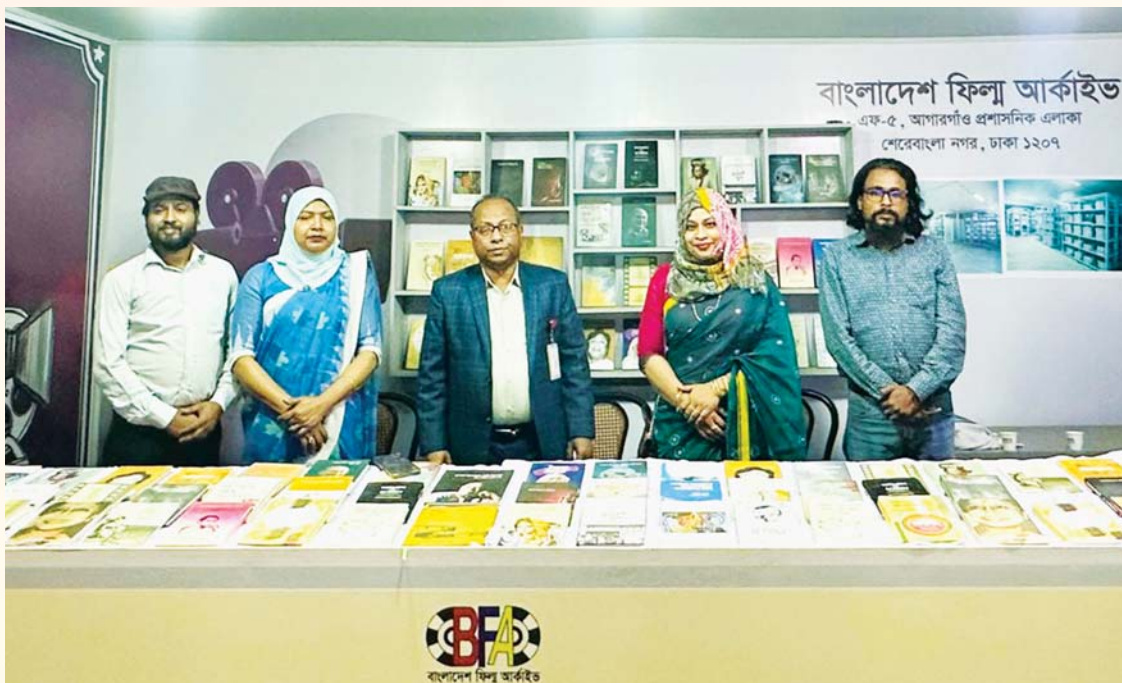
Bangladesh Film Archive Stall on the occasion of International Mother Language Day at Bangla Academy premises, February 2025