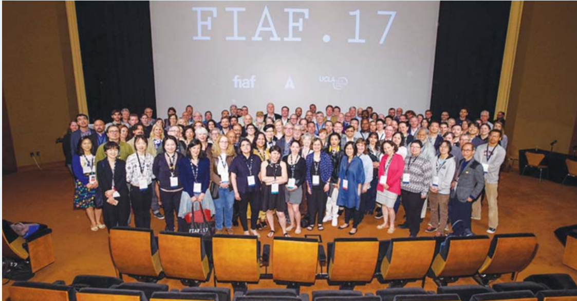
Delegation of Bangladesh Film Archive with participants at the International Federation of Film Archives (FIAF)-Congress held on 28 April-3 May 2017 in Los Angeles, USA