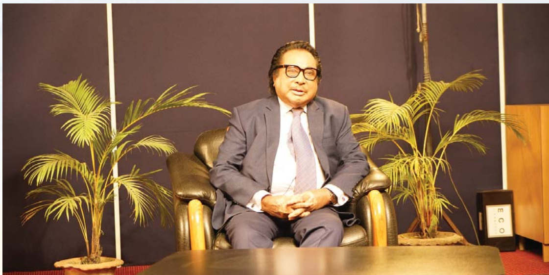
Mega Star Ujjal, prominent Bangladeshi actor, during documentation on his life and achievements at Bangladesh Film Archive, 27 January 2025