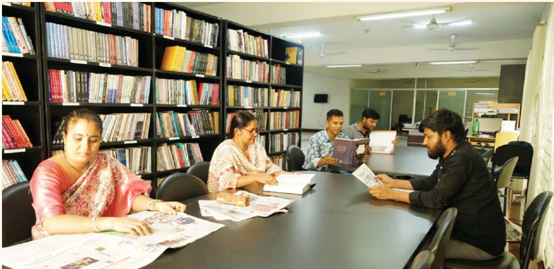
Readers at the Libeary

The extensive duplex special library of Bangladesh Film Archive is an important section for this institution. This specialized library is kept open daily from 9:00am to 5:00pm (except public holidays) for visitors and researchers.