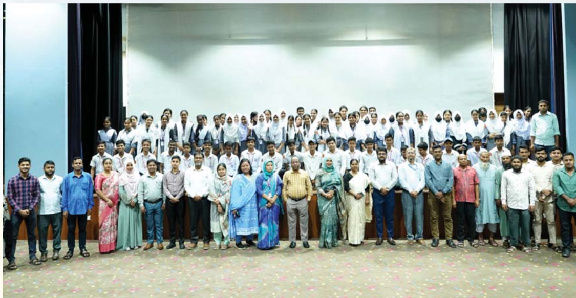
Participants posing with the officials of Bangladesh Film Archive at the week-long programme (15-21 July 2025) under the July Resurgence Programme, 21 July 2025