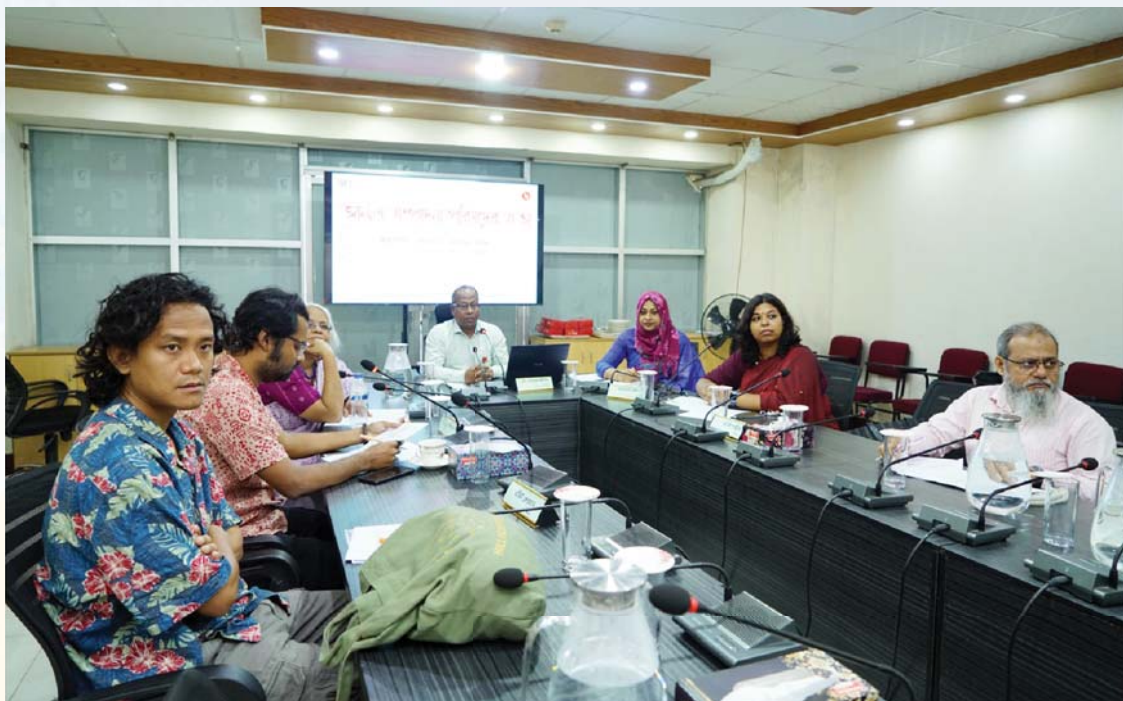
Meeting of the Journal Editorial Committee of BFA, 19 August 2025