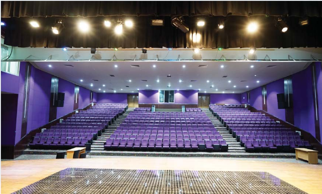
500-seater Multipurpose Auditorium