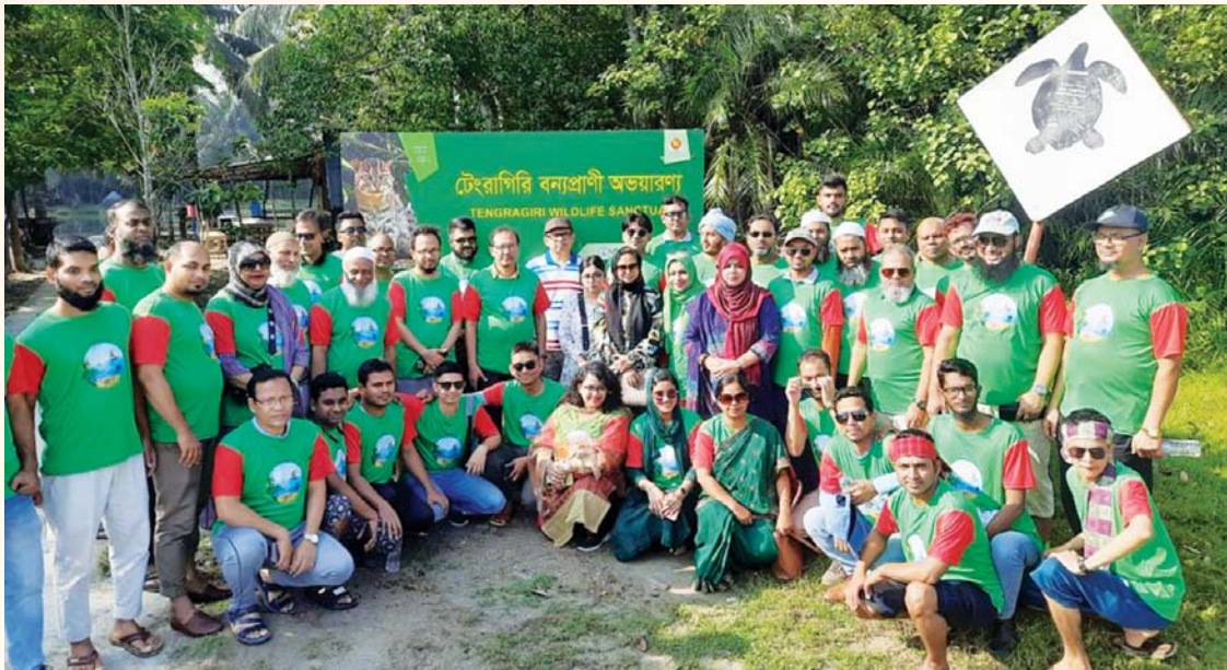
Officials of Bangladesh Film Archive visit of Tengragiri Wildlife Sanctuary under Innovation Training programme of BFA, November 2023