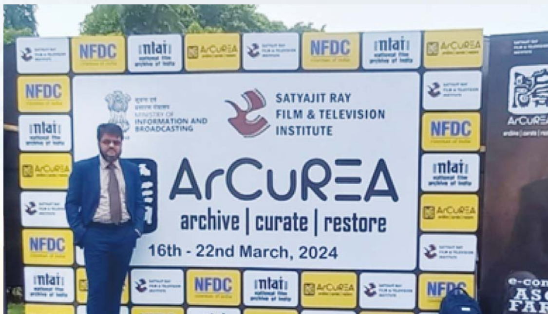
Bangladesh Film Archive delegation at a workshop titled Cultivating Collections: Insights from Asian Archive at ARCUREA 2024, held in Kolkata, India, 17-22 March 2024