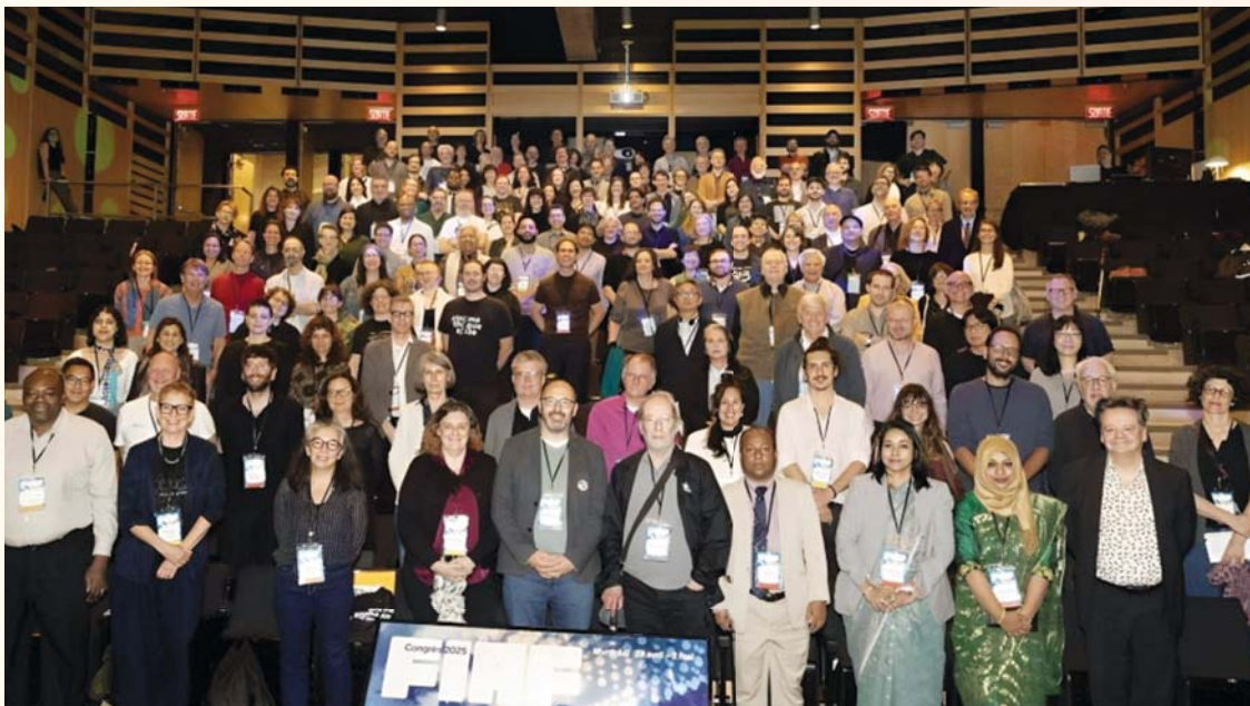
FIAF Congress 2025 group photo at the Auditorium of Grande Bibliothèque de BANQ Cinémathèque Québécoise, Canada, 29 April 2025