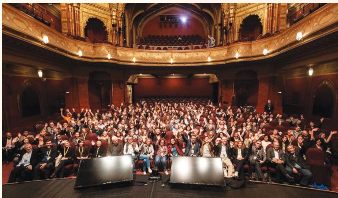
Delegation of Bangladesh Film Archives with the participants at the International Federation of Film Archives (FIAF)-Congress held in April 2022 in Budapest, Hungary