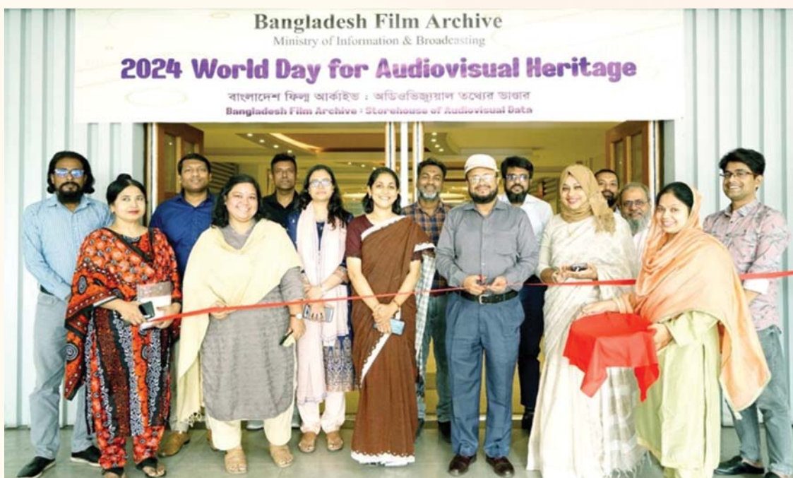
Inauguration of World Day for Audiovisual Heritage, November 2024