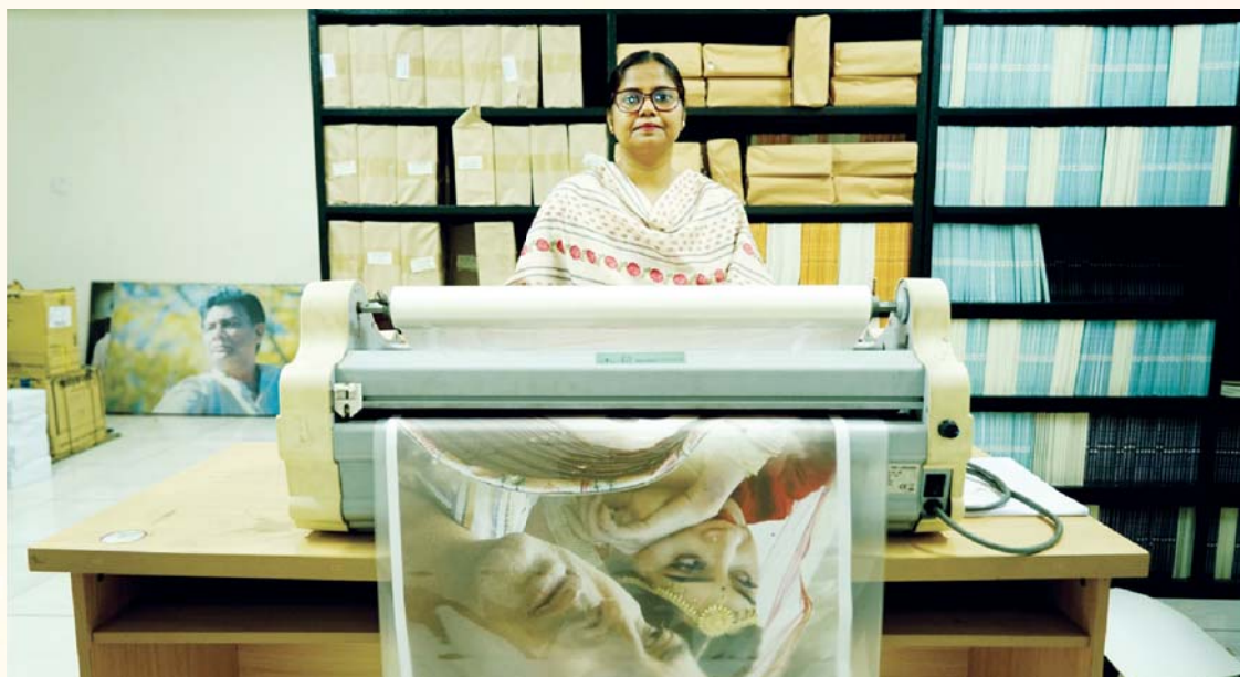
Photo and Poster Lamination process

According to the Citizens Charter (Service Commitment) of Bangladesh Film Archive, to get the above mentioned services, the necessary steps to receive the service must be completed by clicking on the link www.mygov.bd .