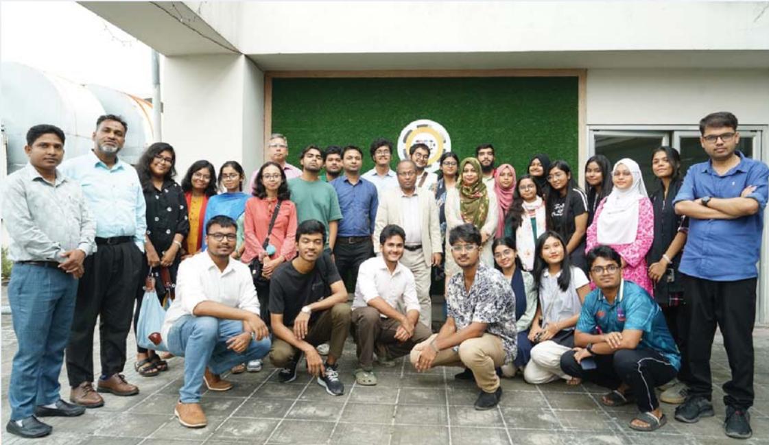
Students from the Department of Television, Film and Photography of Dhaka University, visit the Bangladesh Film Archive, 21 September 2025