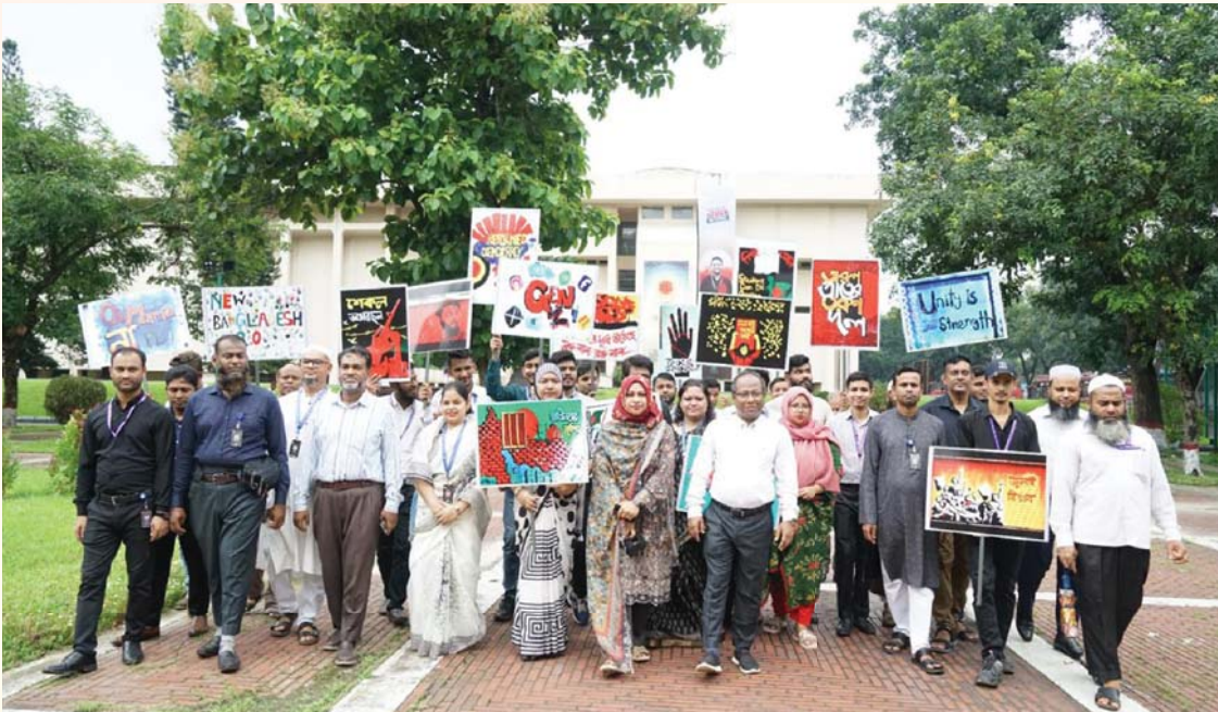
Officials of Bangladesh Film Archive in the July Revival Rally, 2 August 2025