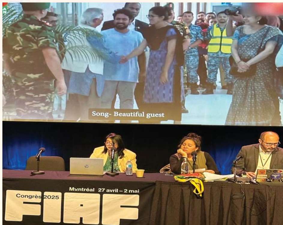
Secretary of the Ministry of Information and Broadcasting, Mahbuba Farjana, delivered speech at the General Assembly on the Bangladesh Government's new initiatives on film and document preservation project titled 'Collection and Preservation of Audio-Visual Documents of the Student Mass Uprising – 2024 from Home and Abroad', 2 May 2025