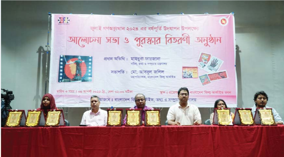
Discussion programme on the occasion of the anniversary of July Uprising 2024, 3 August 2025