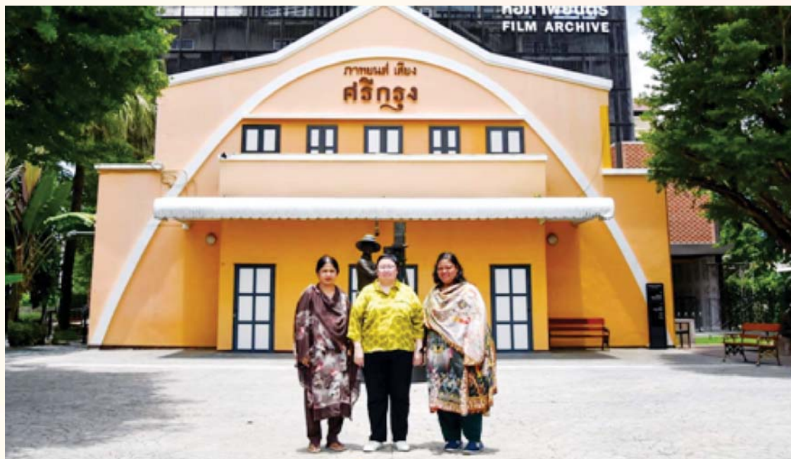
Bangladesh Film Archive delegation in Thai Film Archive under FIAF Internship Fund, Thailand 2022