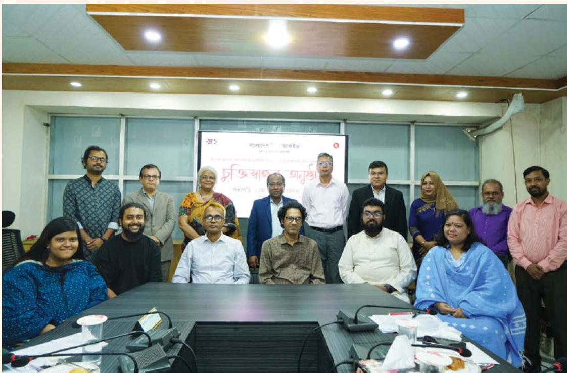
Signing ceremony with the research fellows of Bangladesh Film Archive for the FY 2025-26, 10 August 2025