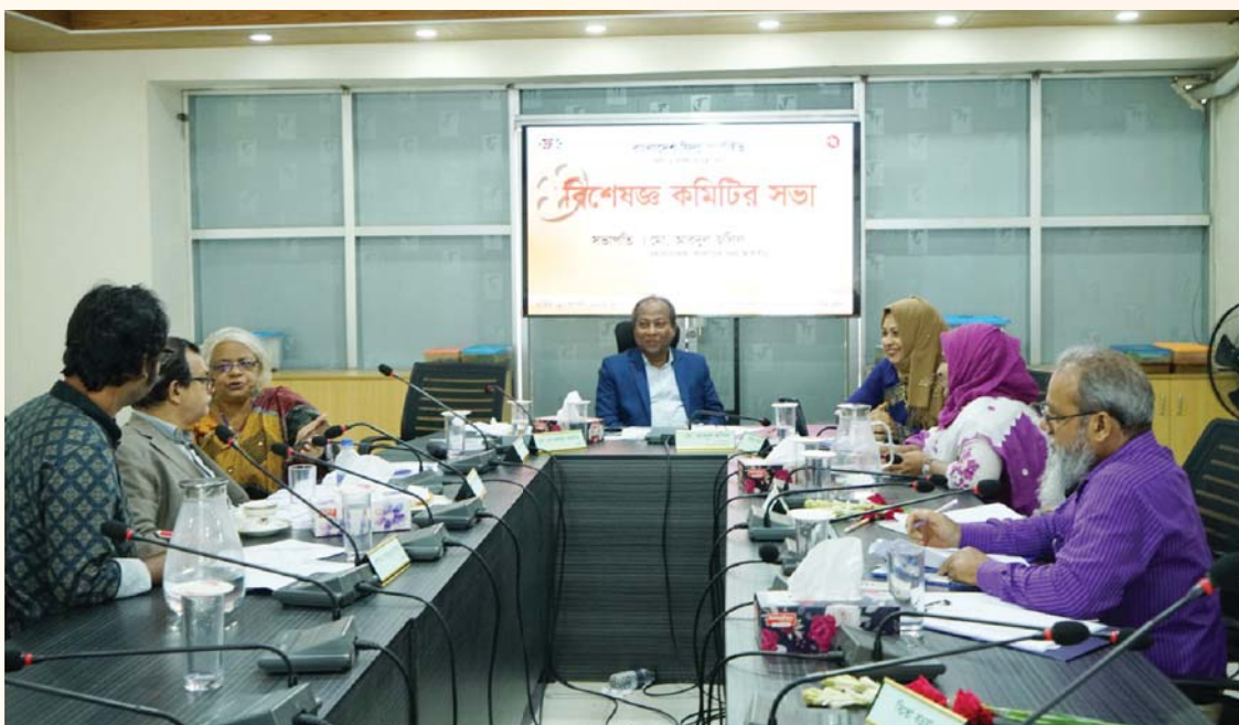
Meeting of the Technical Committee, 10 August 2025