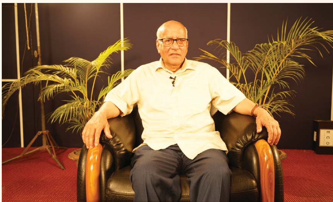
Khurshid Alam, eminent playback singer, during documentation on his life and achievements at Bangladesh Film Archive, 22 January 2025