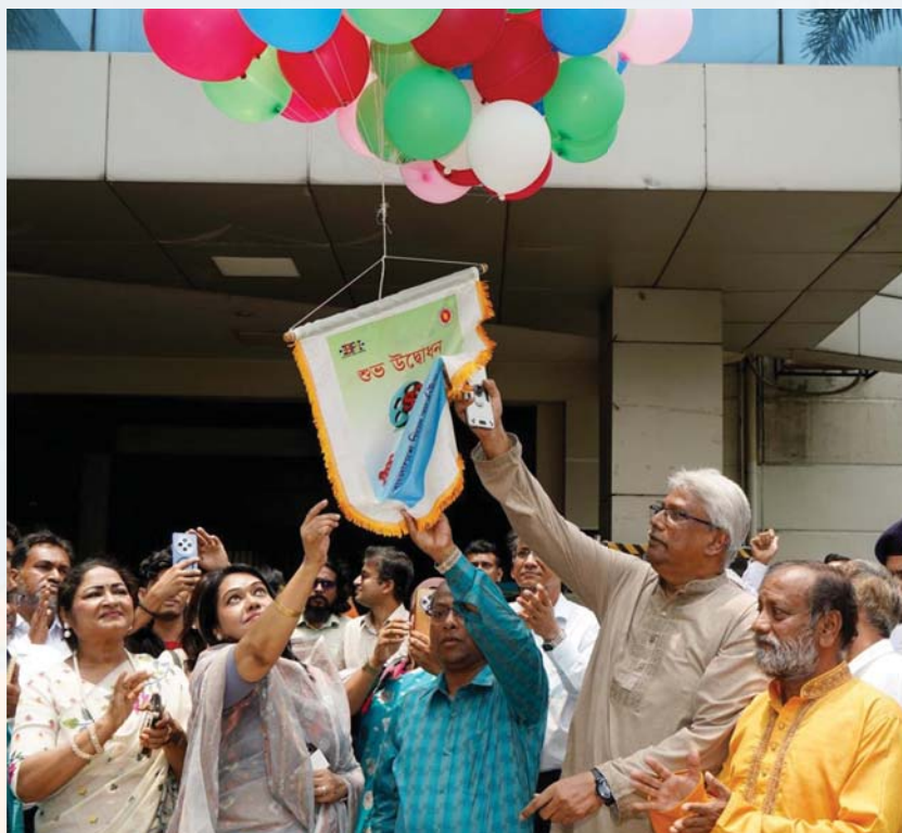
Inauguration and Rally of the 47th Anniversary of Bangladesh Film Archive, 17 May 2025