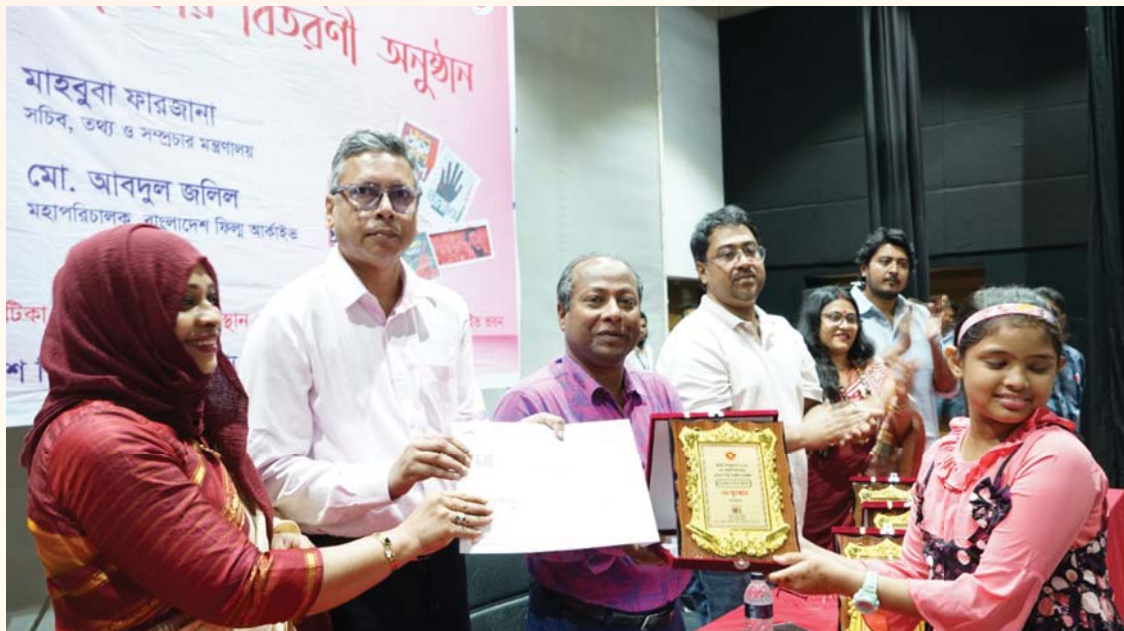
Winners receiving crests at Children's drawing competition on the occasion of July Uprising 2024 held on 3 August 2025