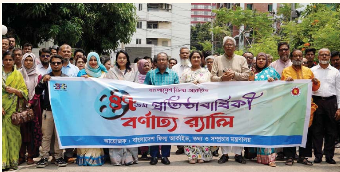
Inauguration and Rally of the 47th Anniversary of Bangladesh Film Archive, 17 May 2025