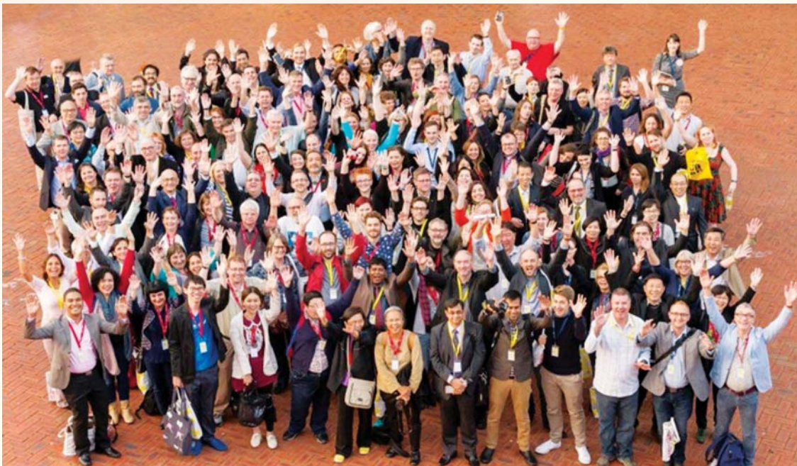
Delegation of Bangladesh Film Archive with participants at the International Federation of Film Archives (FIAF)-Congress held on 12-18 April 2015 in Sydney and Canberra, Australia