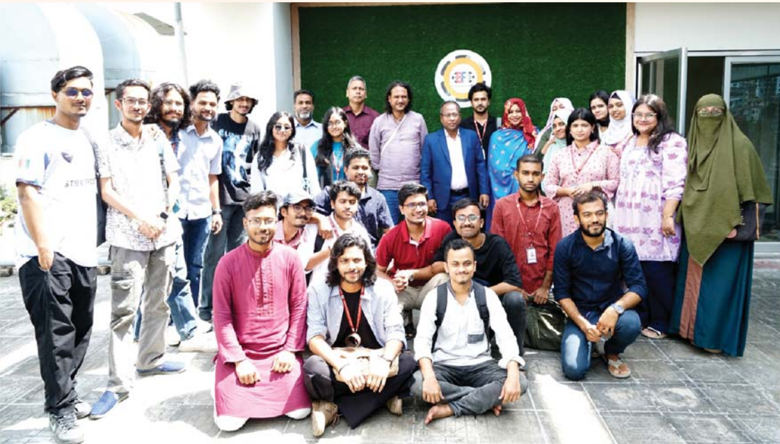
Students of the Film and Television Department of Jagannath University visit the Bangladesh Film Archive, 3 September 2025