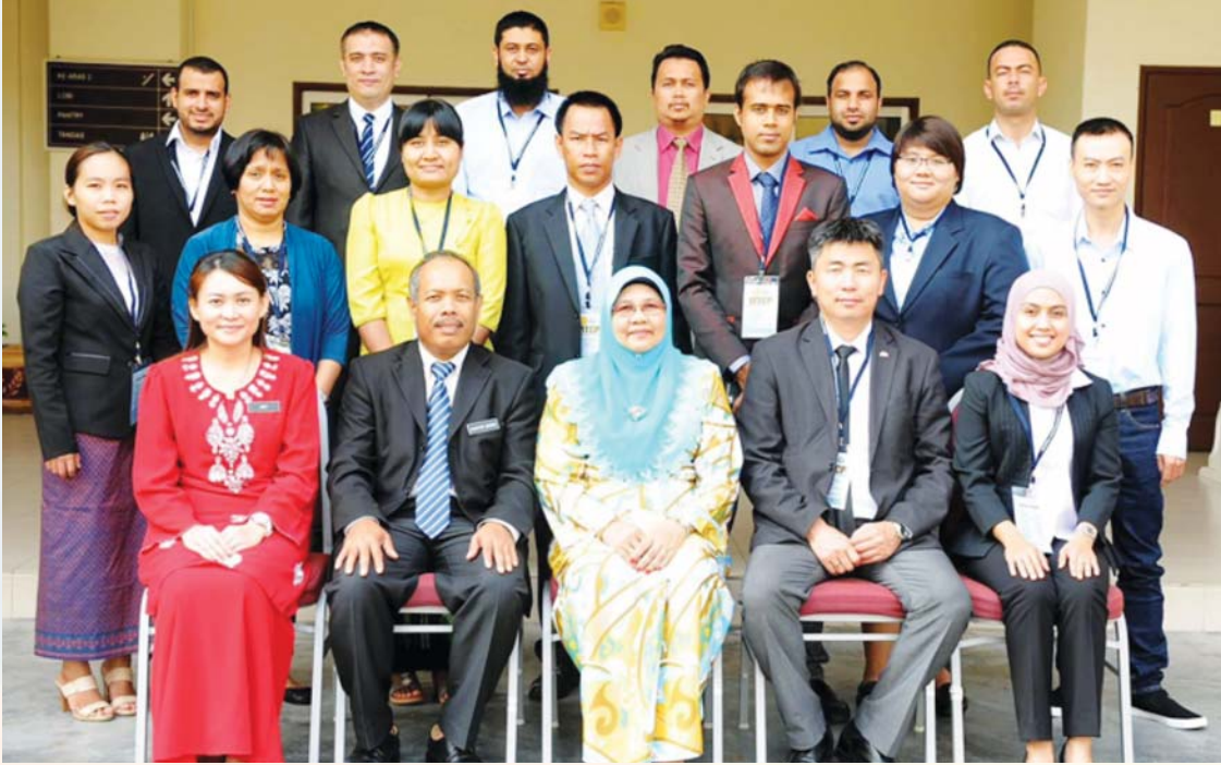
Bangladesh Film Archive delegation in Malaysia Film Archive, 2015