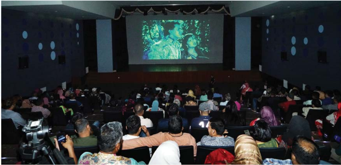
Weekly Film Show at Bangladesh Film Archive projection hall