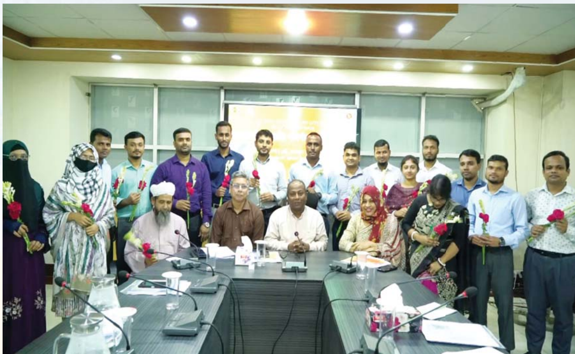
A total of 18 newly recruited employees from grades 13 - 20 of the Ministry of Information and Broadcasting visited Bangladesh Film Archive as a part of their orientation programme, 13 August 2025.