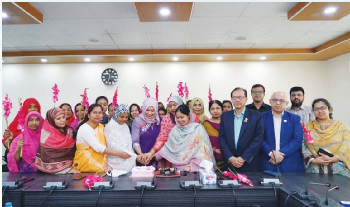
Celebration of World Women's Day, 8 March 2023