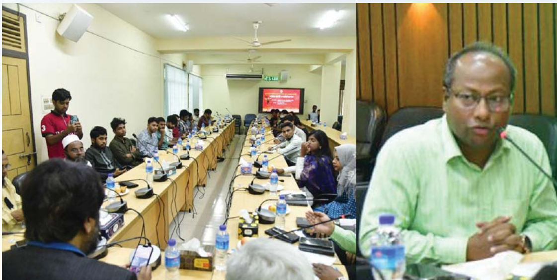
Film screening and views exchange meeting with Shahjalal University of Science and Technology under the July Rejuvenation Programme 2025, Shylet, 18 July 2025