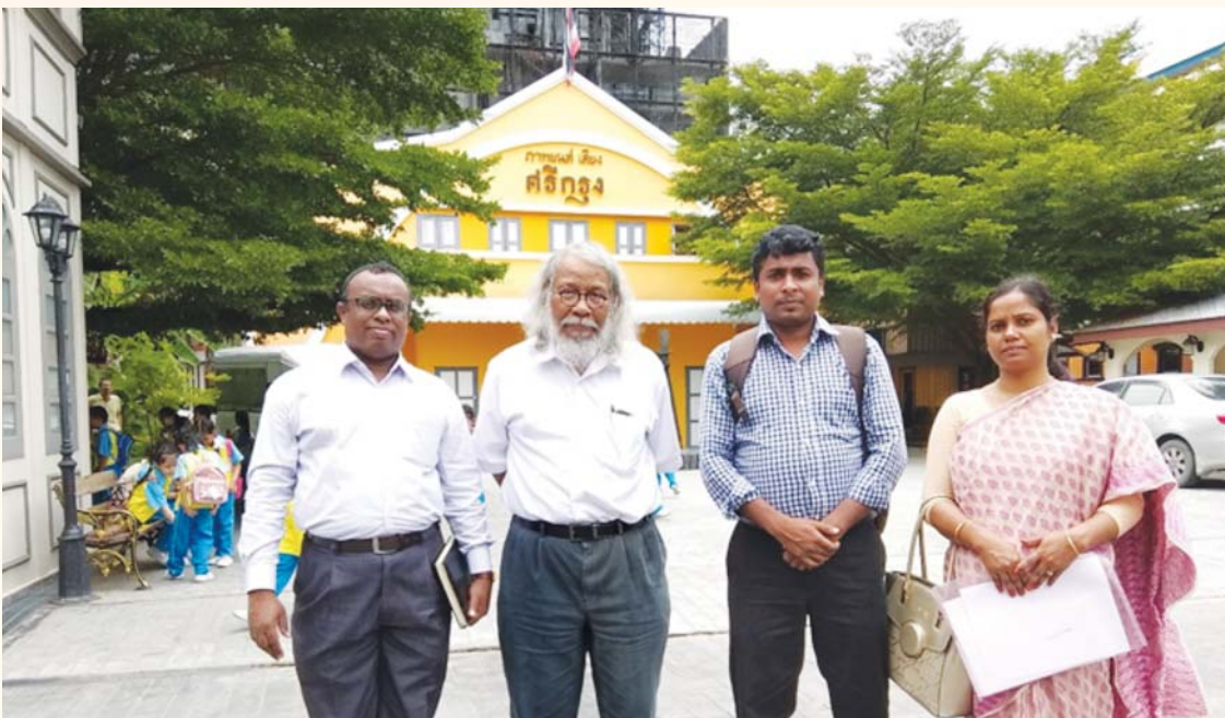
Bangladesh delegation visits Thai Film Archive, Thailand, 2017