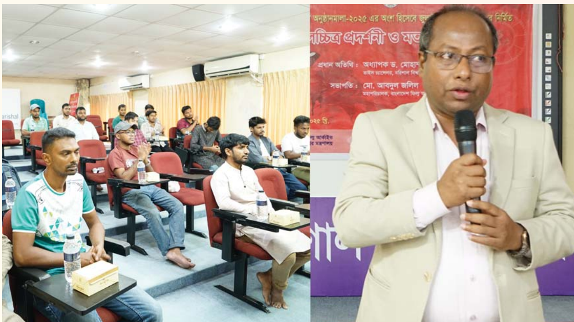
Film screening and views exchange meeting with Barishal University under the July Rejuvenation Programme 2025, 25 July 2025