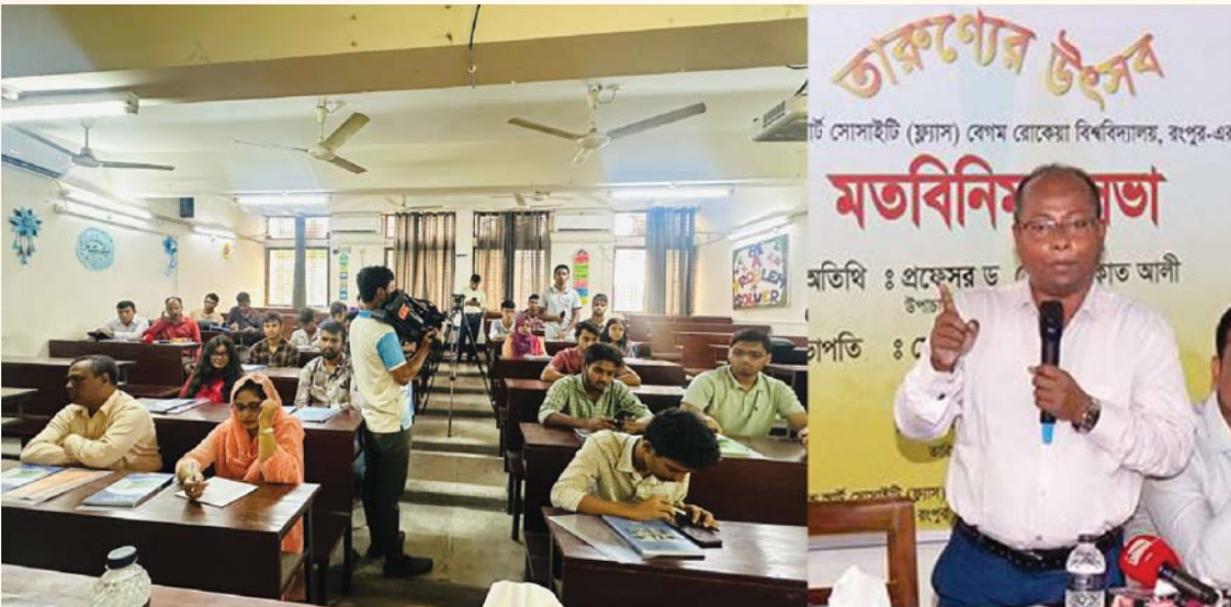
Film screening and views exchange meeting with Begum Rokeya University under the July Rejuvenation Programme 2025, Rangpur, 20 June 2025