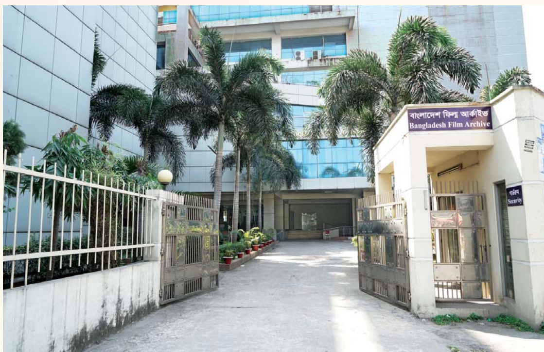
Entrance of the Bangladesh Film Archive

An Archive is a repository or store house. Important government records and other valuable historical documents are kept here in a well-organized process. Mostly Film related as well as audio documents are preserved here. The role of archive in conserving heritage and history is recognized globally. Each and every country in the world has its own archive. It is known from history that the first archive was established by the Sumerians. Archaeologists discovered an archive of hundreds of clay tablets dating back to the 3rd and 2nd millennium BC. These discoveries served as fundamental sources for knowledge of the ancient alphabet, language, literature and politics of the time and also established the concept of archives. Assurbanipal, one of the kings of the Assyrian civilization centered in the Middle East-Asia Minor in the 7th century BC, was famous for his own collection. During the Sultanate and Mughal Period in the Indian subcontinent, administrative documents and records were kept in archives called Mahafezkhana. However, document's preservation in the subcontinent gradually started centrally, provincially and locally from the British period.