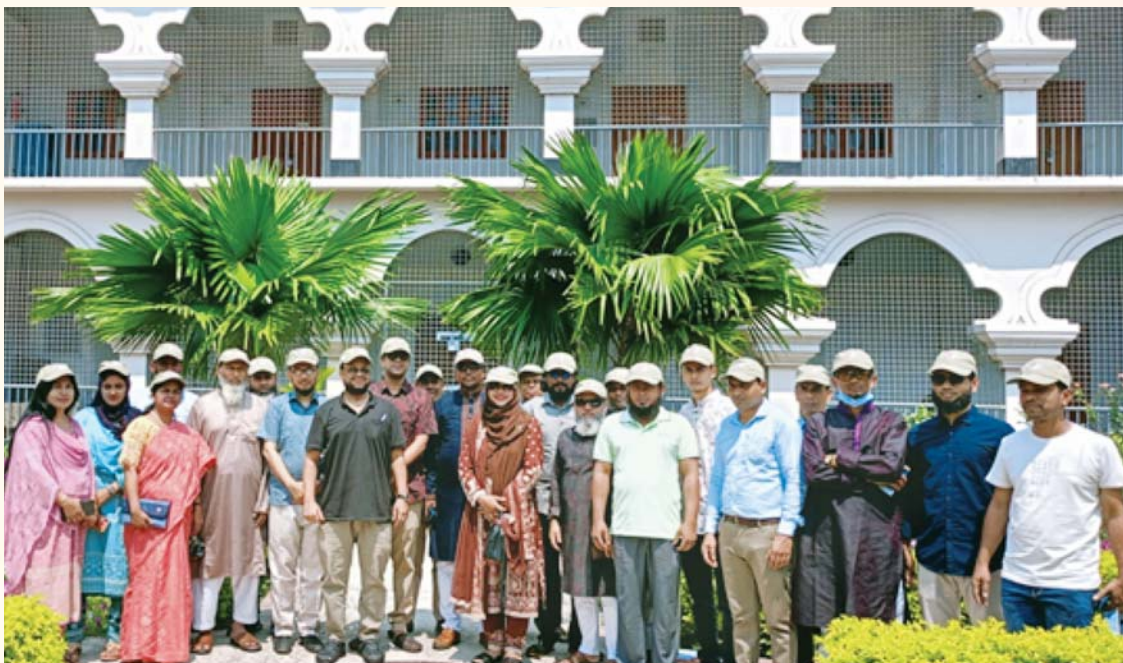
Trainees of BFA visiting Rajshahi Barendra Museum under Refreshing programme in May 2024