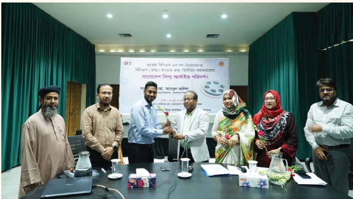
Newly recruited BCS (Information) cadre of 43rd BCS and 9th grade officers of BTV visit Bangladesh Film Archive, 3 June 2025