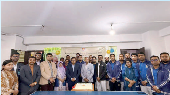
Honourable Director General of BCS (Tax) Academy inaugurating the sports competition of AFC 30 and AFC 31