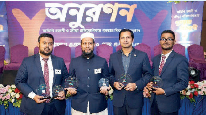
The trainees cheered with joy after receiving prizes in the sports competition.