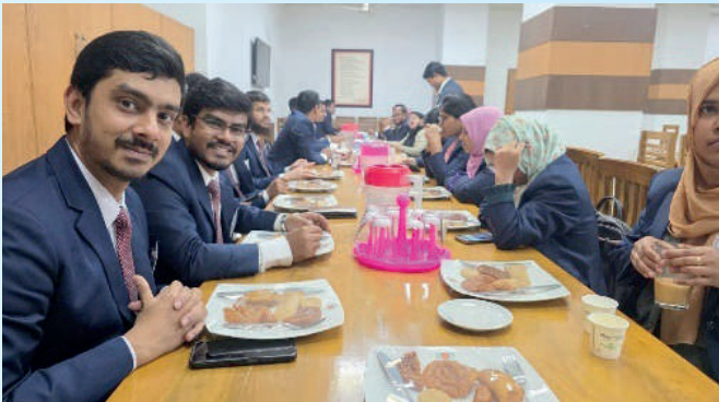
The trainees organized a lively Pitha Utsav