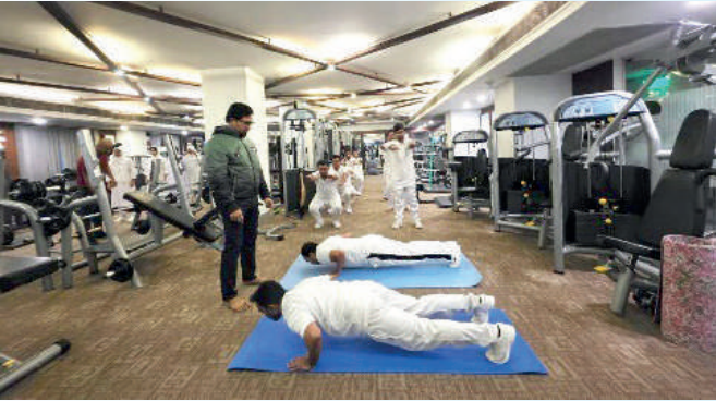
The trainees during a morning gym session