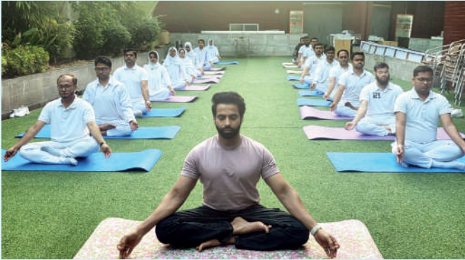
The trainees during a morning yoga session