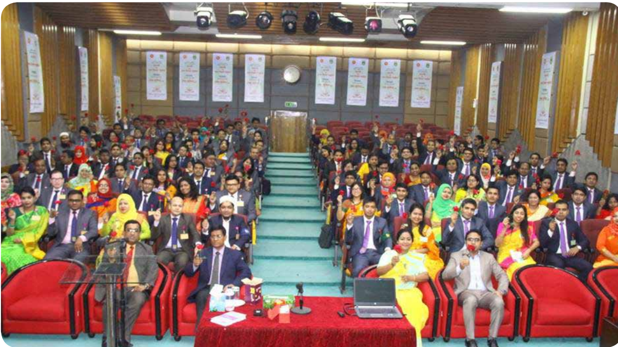
Celebration of spring of 104 th , 105 th and 106 th Law and Administration Course