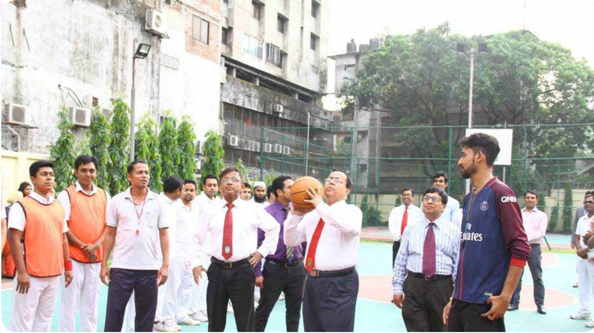
Honorable Rector opening the sports Competition of 104 th , 105 th and 106 th Law and Administration Course