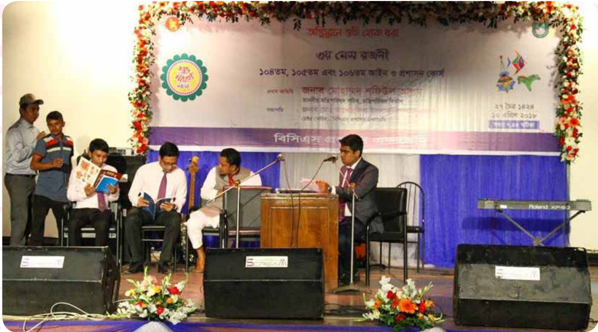
Participants in a stage drama at 3 rd Mess Night