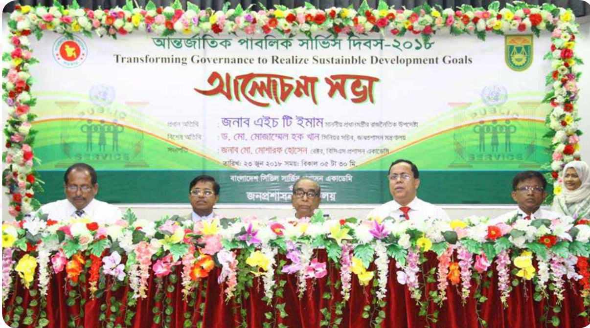
Observation of International Public Service Day