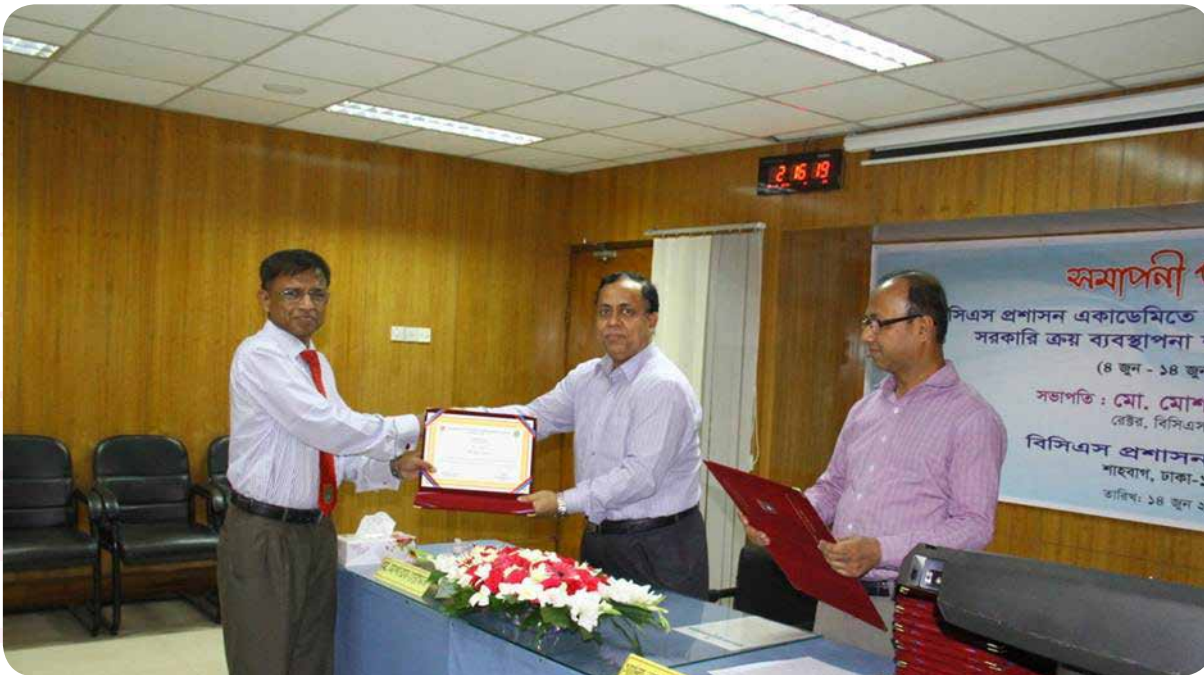
Awarding certificate in public procurement course