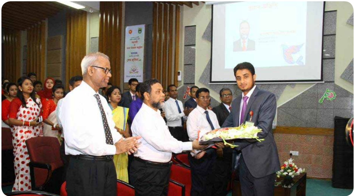
Receiving honorable cabinet secretary at the 2 nd Mess Night