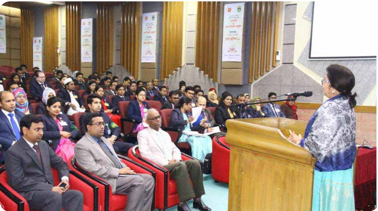
Editor of the The Daily Ettefaq while conducting a session