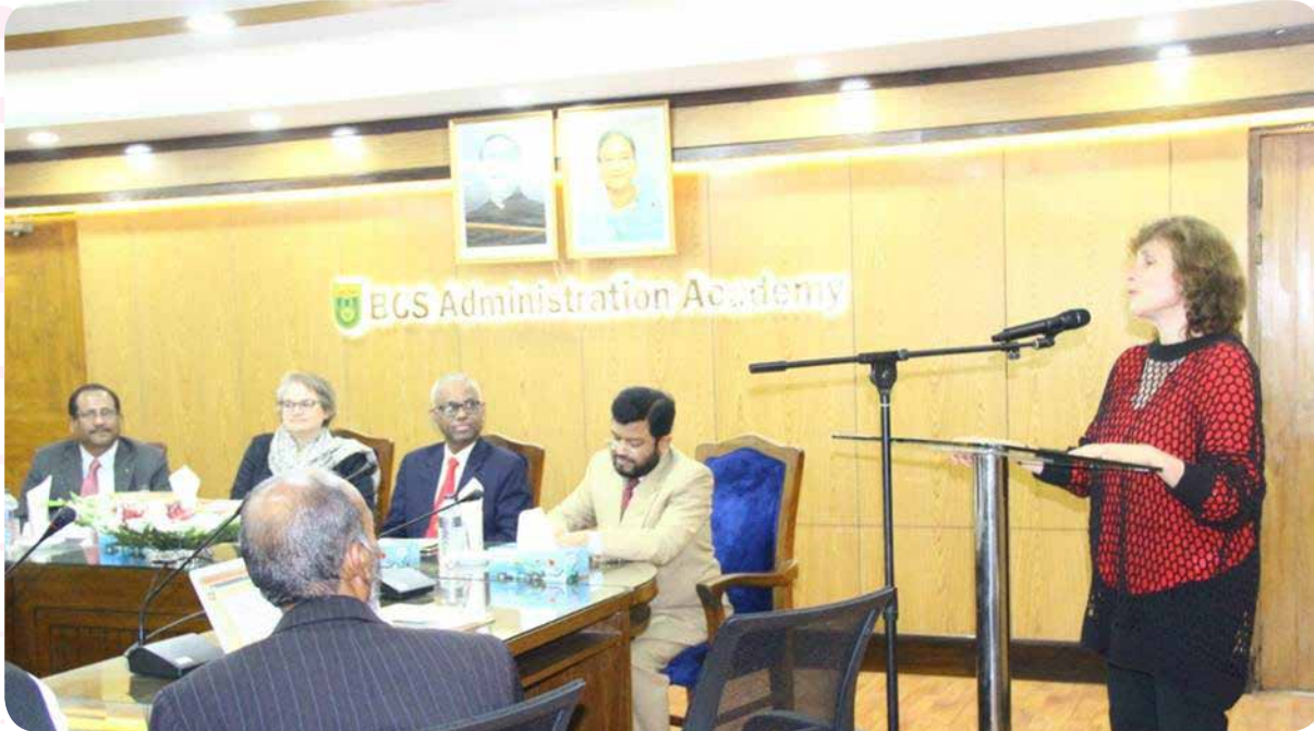
Foreign delegate speaking to a program at BCSAA