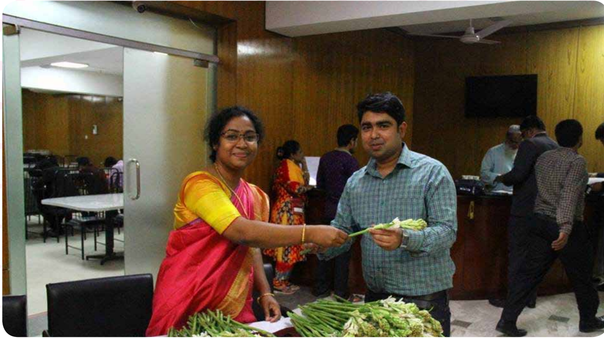
Receiving a participant at the registration booth of 104 th , 105 th and 106 th Law and Administration Course