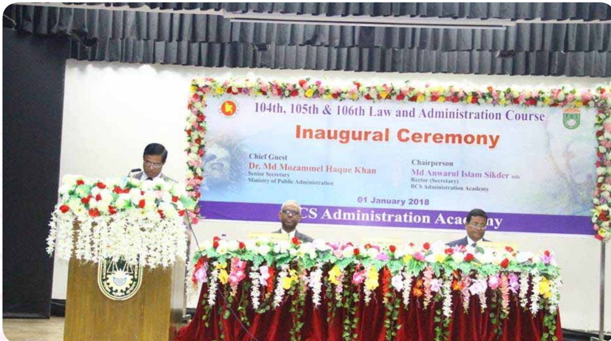
Chief guest speaking in the inaugural ceremony of 104 th , 105 th and 106 th Law and Administration Course