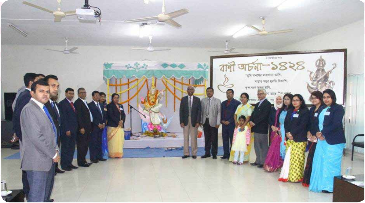
Celebrating Bani- Archana 1424