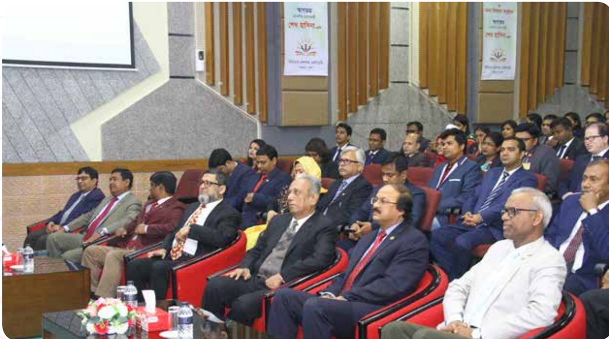
A Moment of the Guest Night of A65th Foundation Training Course