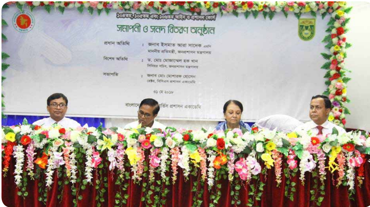
Honorable guests in the closing ceremony of 104 th , 105 th and 106 th Law and Administration course