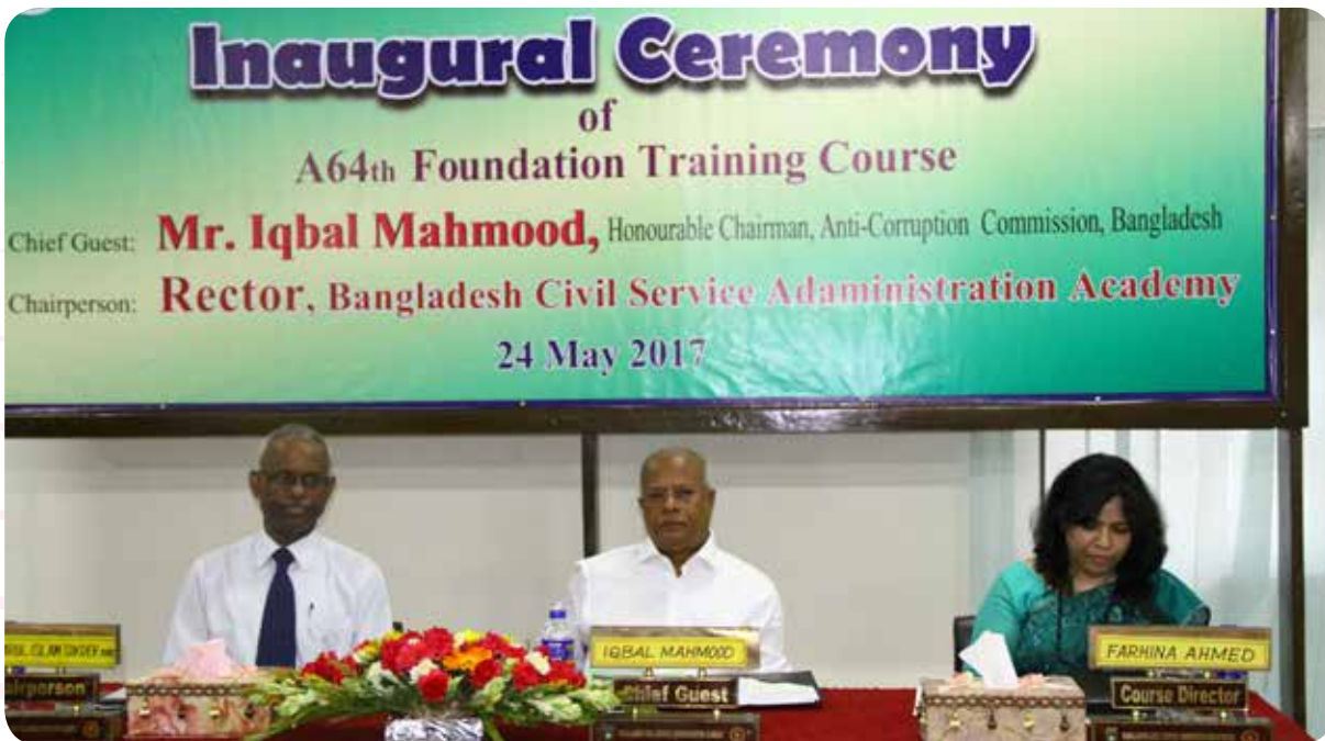
Chief Guest at the Inaugural Ceremony of A64th Foundation Training Course