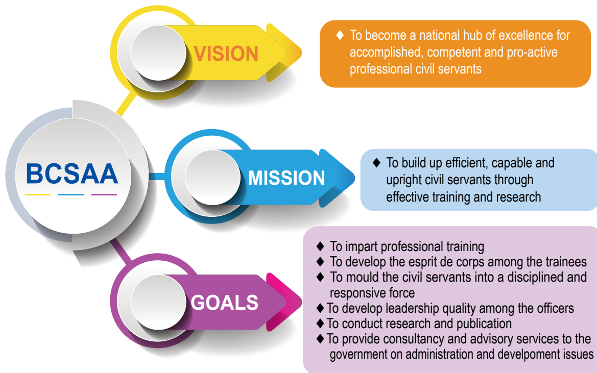
Figure 1: Vision, Mission and Goals of BCSAA