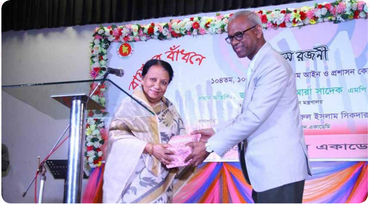
Honorable chief guest receiving a gift from the Rector of BCSAA at the 1 st Mess Night